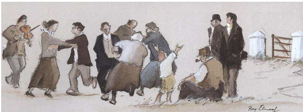
Couples danced to music from a fiddler 'of the most grotesque appearance' on the completion of the joint drainage project