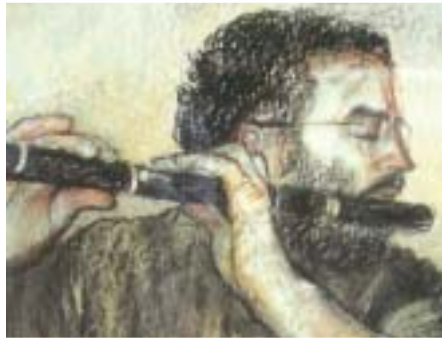
30. Noel (Detail)