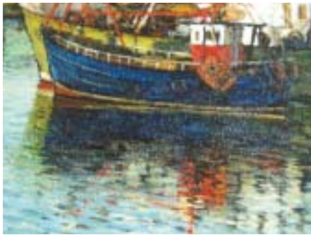
33. The Catch