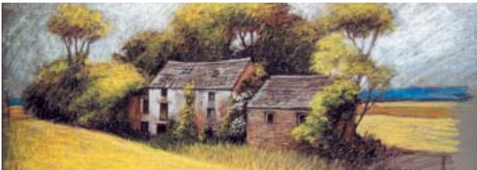
17. Full Of Ghosts