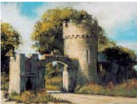
45. Teach An Gheata