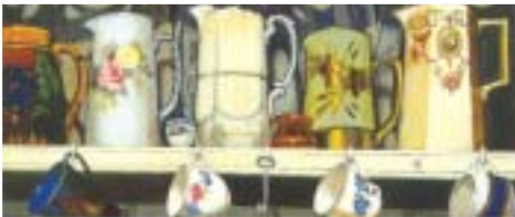
22. The Key