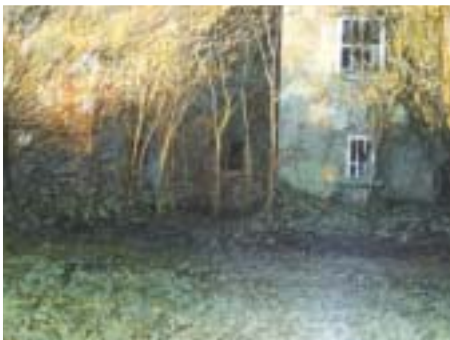
28. Martinis House, Dunmore