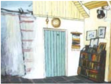
40. The Fish On The Door