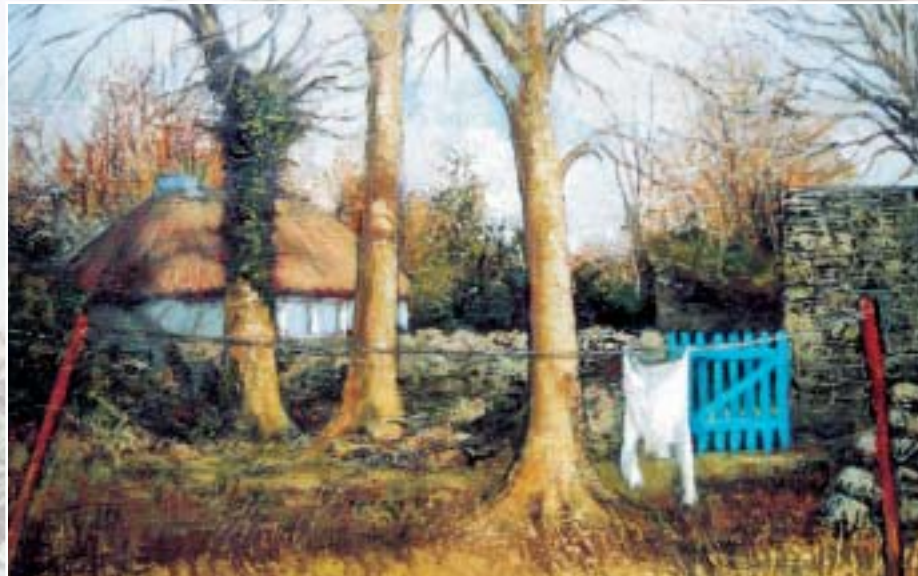
37. An Leine Domhnaigh