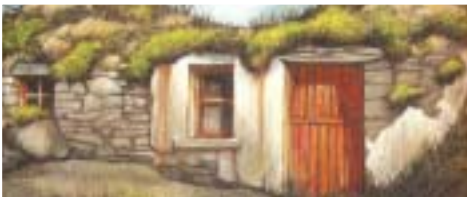
20. The Red Door