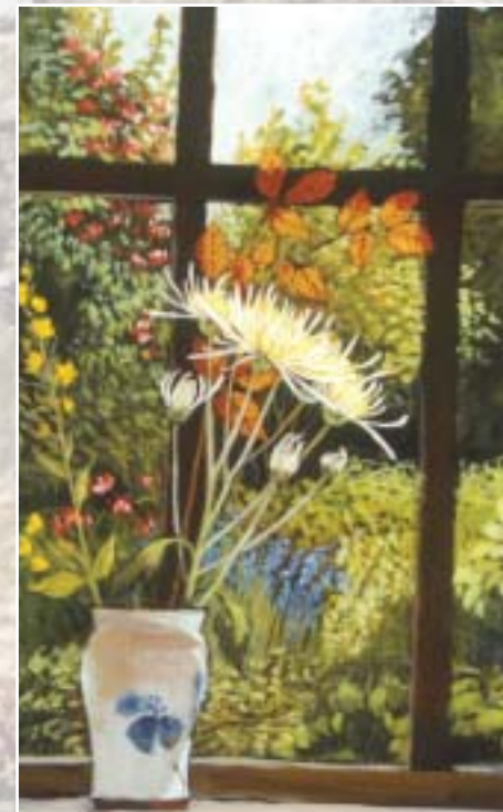
25. Wild Flowers