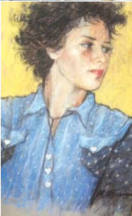
11. The Blue Blouse