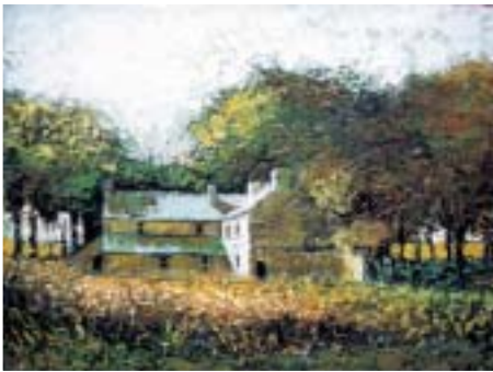
38. Near Dunmore