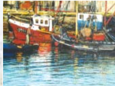
35. Docks study