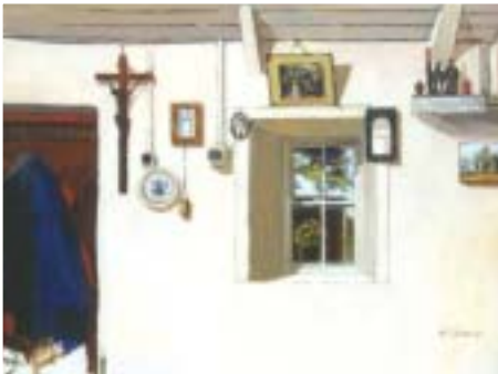
26. Taobh Istigh