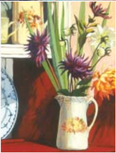
24. The Cracked Jug