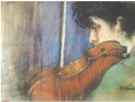
9. Woman Fiddle Player