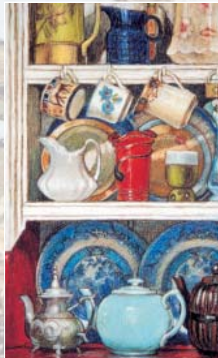
18. My Dresser