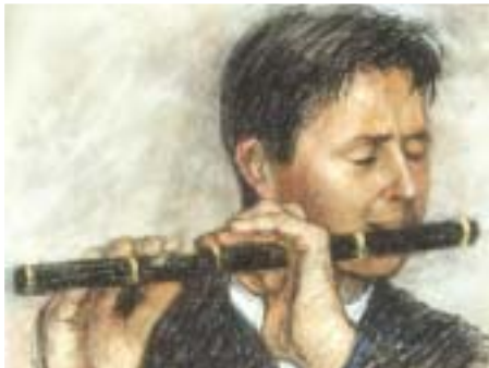
8. Flute Play