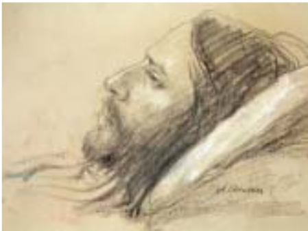
7. Pensive Mood