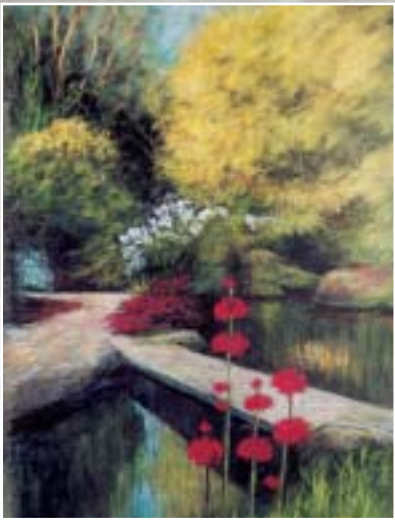
1. The Pond