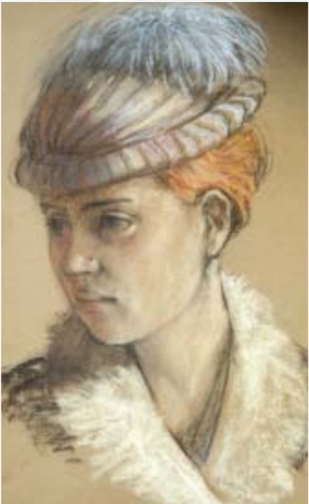
5. An Bhean Ruadh