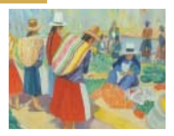
32. Market At Chinchero