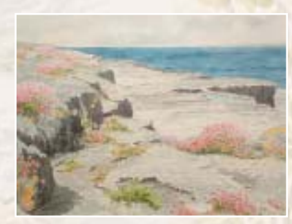
[19] Sea Pinks at the Flaggy Shore