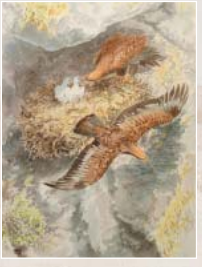
[1] Once upon a time at Eagle's Rock