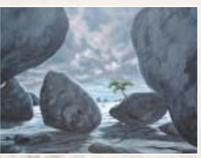
[40] Rock Forest