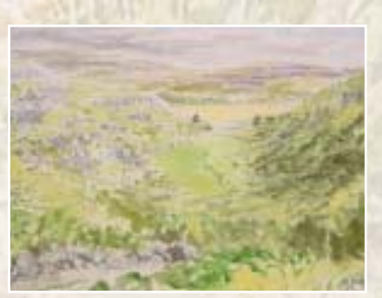
[10] Glen of Clab (field sketch)