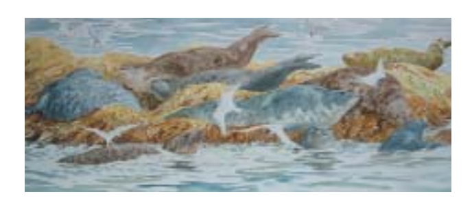
Common Seals and Terns, Ballywughan Bay