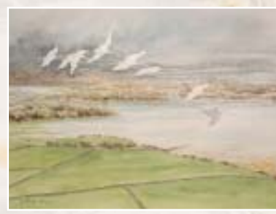
[9] Wild Swans at Carron