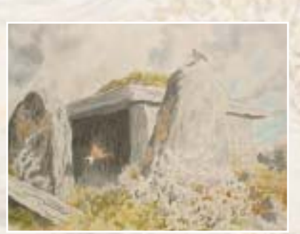
[5] Wheatears at Wedge Tomb