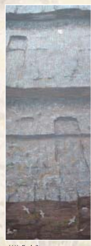
[46] Rock Steps