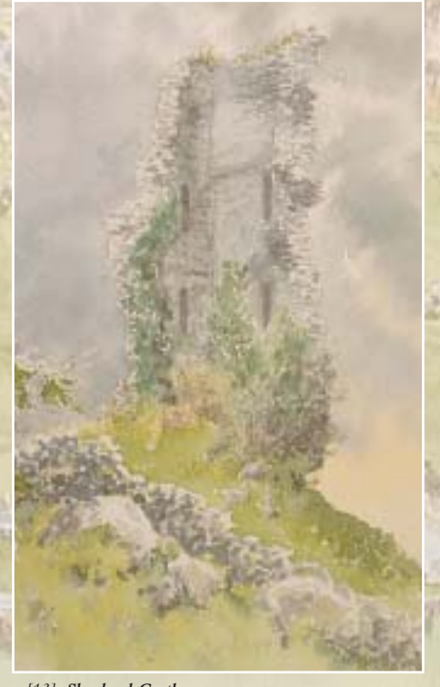
[13] Skaghard Castle

Director, Huston Film School National University of Ireland, Galway.