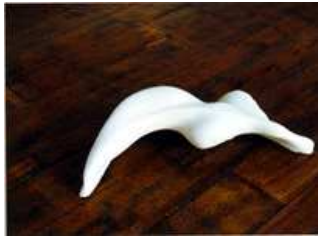
40. 'Inside #2' White clay 40x100x45cm £1,535