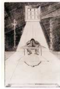
18. Dream choice (b/w) Framed: £270 Unframed: £220