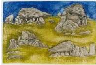
19. Points of view (colour) Framed: £325 Unframed: £290