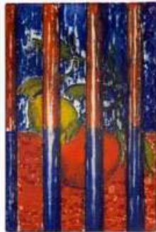
13. Forbidden fruit (colour) Framed: £415 Unframed: £365