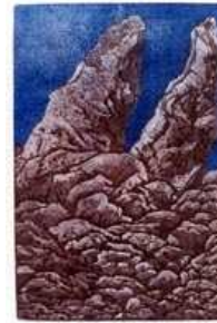
28. Seeing through, Cleggan (colour) Framed: £325 Unframed: £290