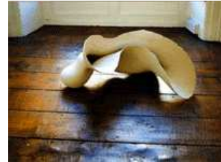
47. 'Slabhra #1' White clay 70x120x60cm £1,445