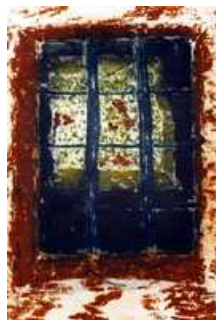
15. Window of hope (colour) Framed: £415 Unframed: £365