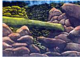
2. The hidden road Framed: £850 Unframed: £740