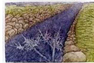
22. Choosing the hard road (colour) Framed: £325 Unframed: £290