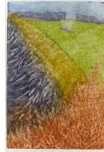
26. Gateway to the sky (colour) Framed: £325 Unframed: £290