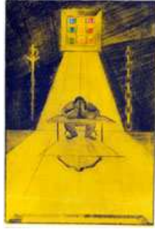
17. Dream choice (colour) Framed: £415 Unframed: £365