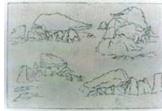
20. Points of view (etched drawing) Framed: £220 Unframed: £180