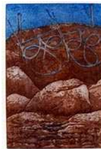
24. Sweet dreams (colour) Framed: £325 Unframed: £290