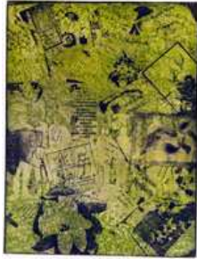
9. The final road (either colour) Framed: £455 Unframed: £380