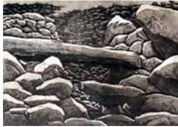
3. The hidden road (b/w) Framed: £650 Unframed: £545