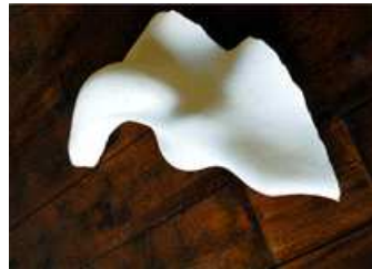
48. 'Slabhra #2' White clay 55x115x65cm £1,445