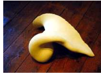
39. 'Inside #1' White clay 45x60x40cm £1,445