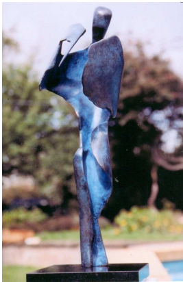
The Conductor, Bronze, 97x45 cm, Edition 1 of 3, Dublin Concert Hall

Although I have undertaken various commissions, my sculptural journey has been drawn more from a private and personal source than from public or corporate demands.