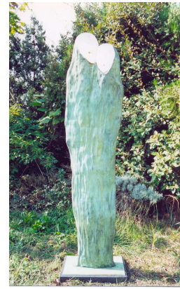
Couple II, 188.5x50.5 cm, Bronze, Edition 1 of 3