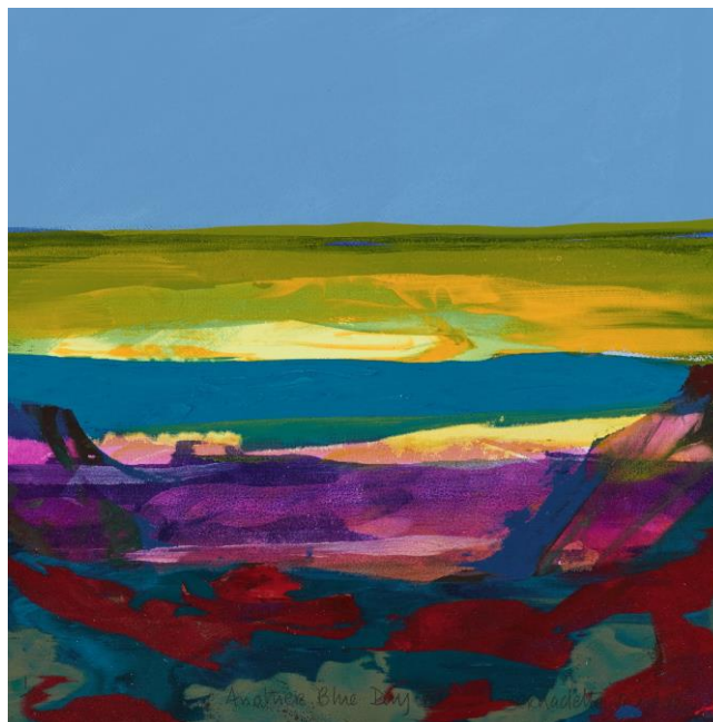
Bernadette Madden, Another Blue Day VI, Screenprint on paper