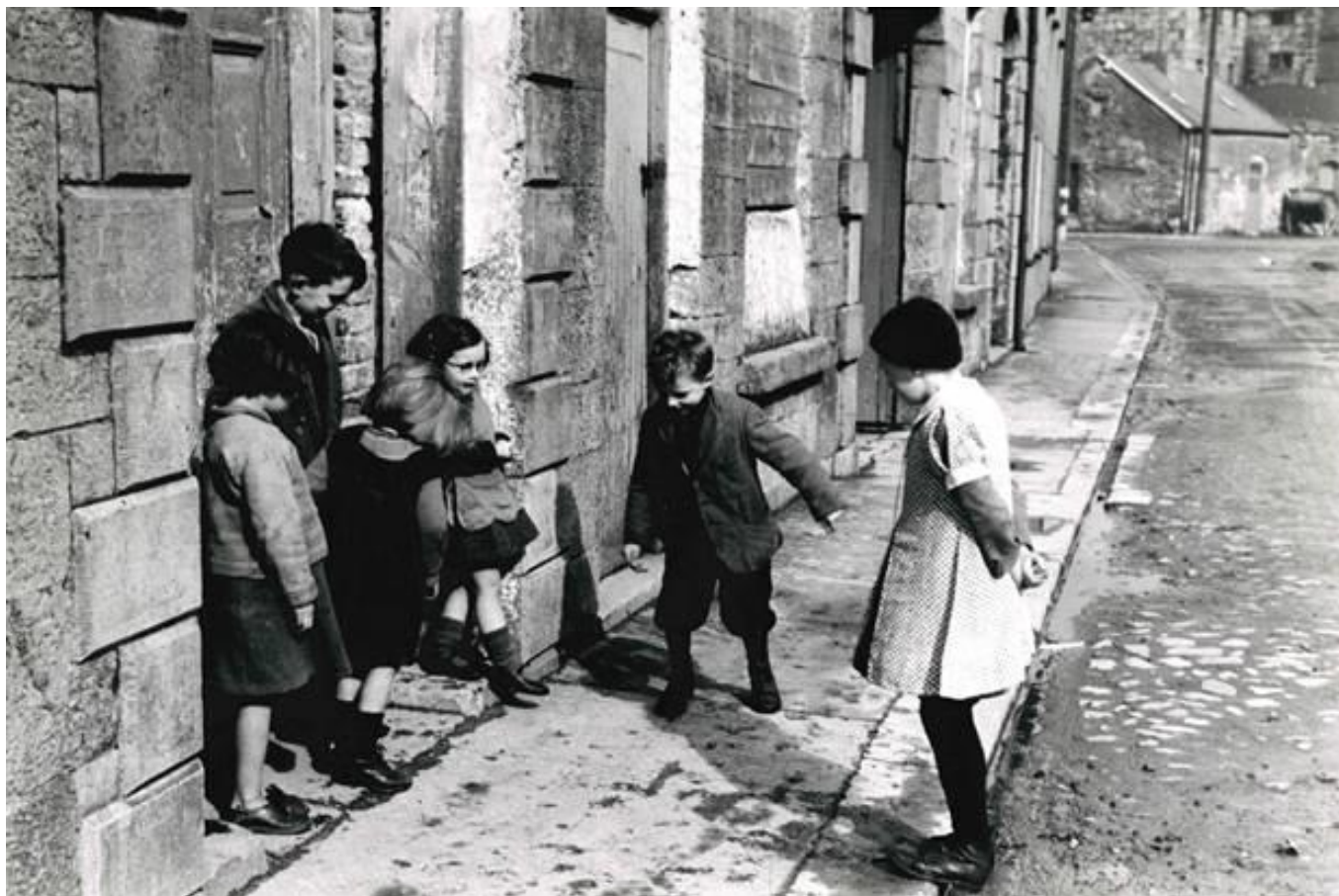
Children playing, Galway