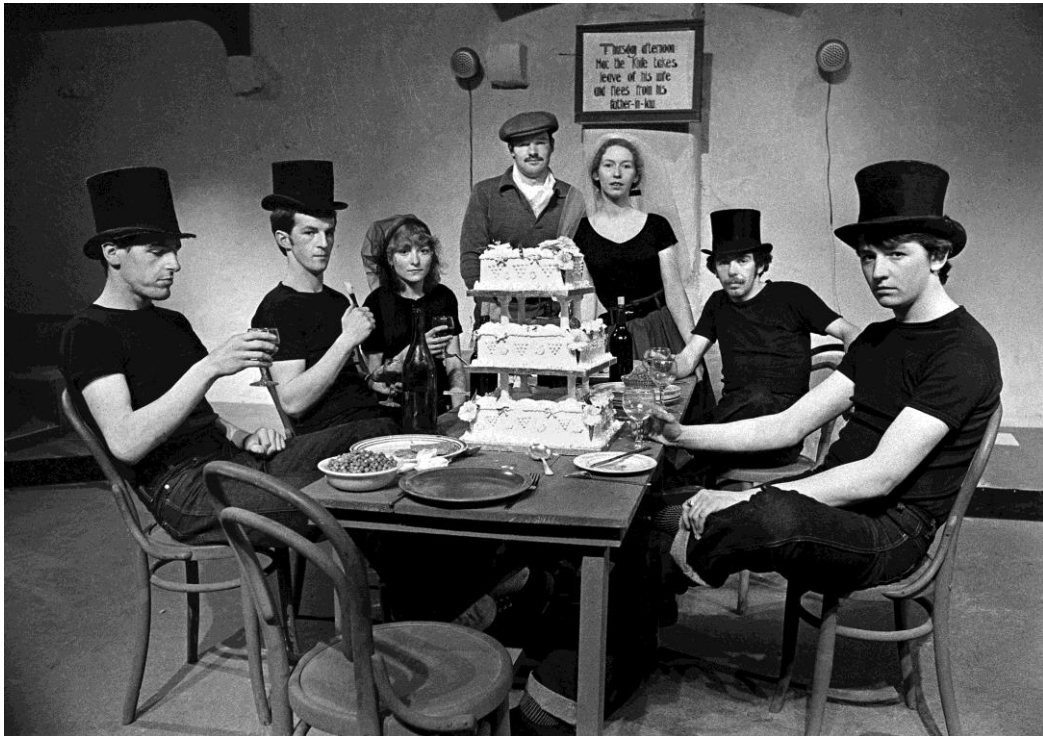
Cast of The Threepenny Opera - staged for the opening of Druid Theatre's new premises at Chapel Lane (renamed Druid Lane) in the 1970's