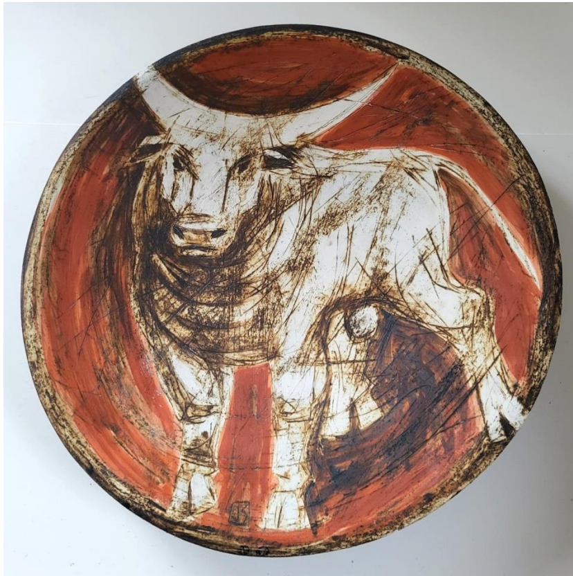
Jane Seymour, White Bull, Ceramic, 19in dia