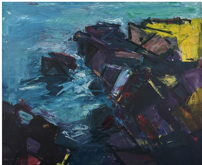
Brian Ballard, Rock And Sea, Yellow (2013), Oil, 100x120cm

Gallery hours: Monday to Saturday, 9:00-17:00. Admission is free and all are welcome (official opening details TBC)