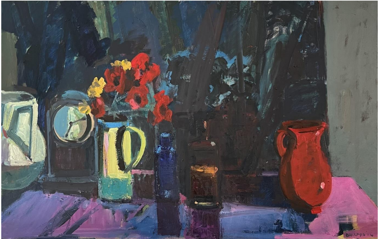
Brian Ballard, Poppies With Clock (2024), Oil, 81x122 cm

Subscribe to our mailing list for news, offers & invitations to events >>