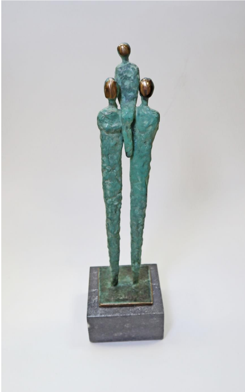
< Pádraic Reaney, Family of Three II Bronze, Unique, 12.5x3x3in