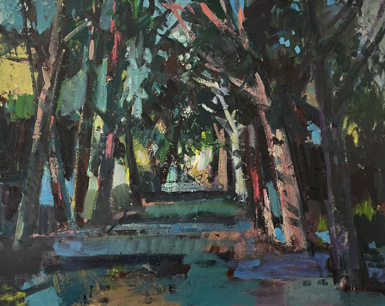
Brian Ballard, Dark Trees, Cyprus Avenue (2023), Oil, 80x100cm