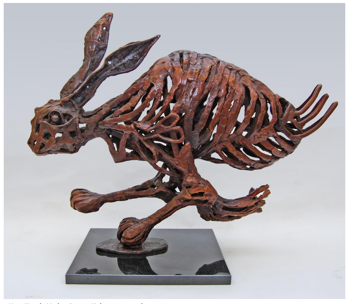
No. 2 Hare in Motion, Bronze, Unique, 20.5x25x4in, €7,500 Below (L) No. 45 On Dooagh Beach, Acrylic on Board, 18x22in, €2,000 (R) No. 57 Clay is the Word - P.K., Acrylic on Canvas, 20x16in, €1,650