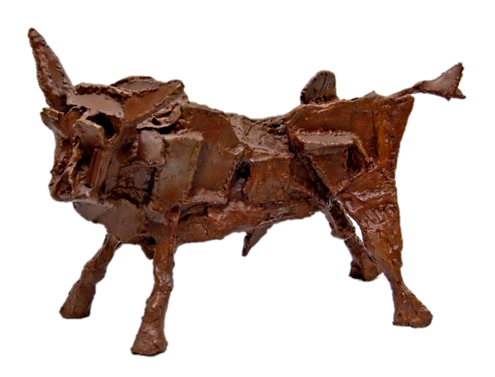
No.9 Weld Bull II , Bronze, Unique 16x25x10in, €8,000 No.6 Four Horsemen of the Apocalypse, Bronze, Unique, 23.5x20x18in, € 8,500