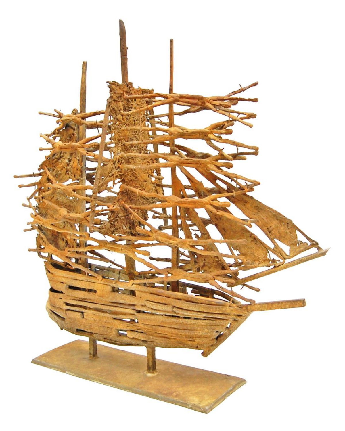
No. 10 West Coast Famineship Bronze, Edition of 9, 26x27x10in, €9,000