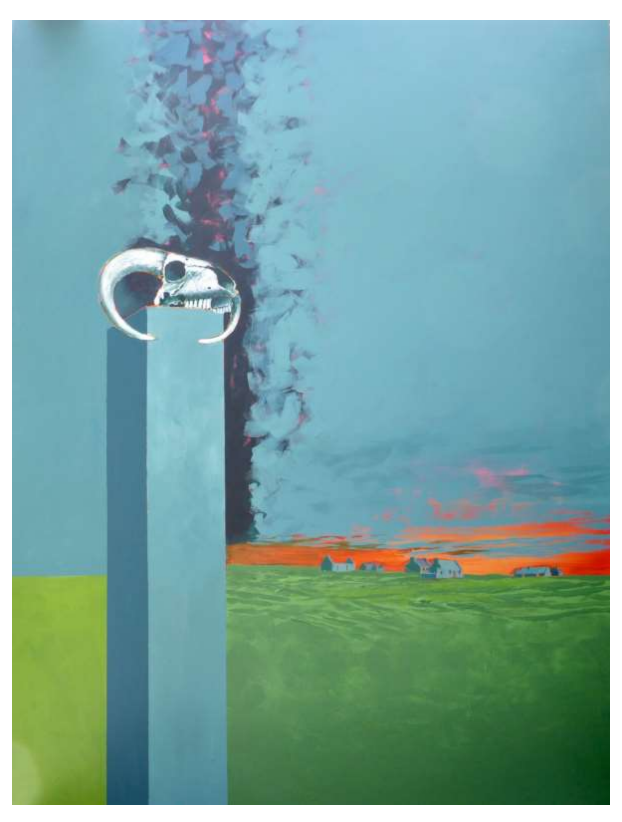
Pádraic Reaney, Inishark Island. Acrylic on Board. 48x32in