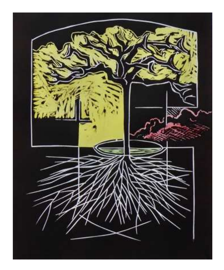
Pádraic Reaney, Tree, Tenerife, Block Print, 15x12in