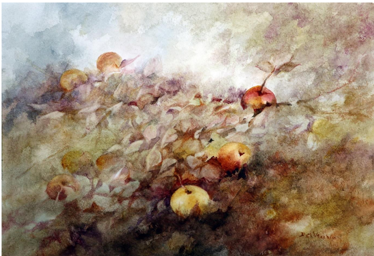
Phyllis Del Vecchio, Windfall , Watercolour, 11x15in