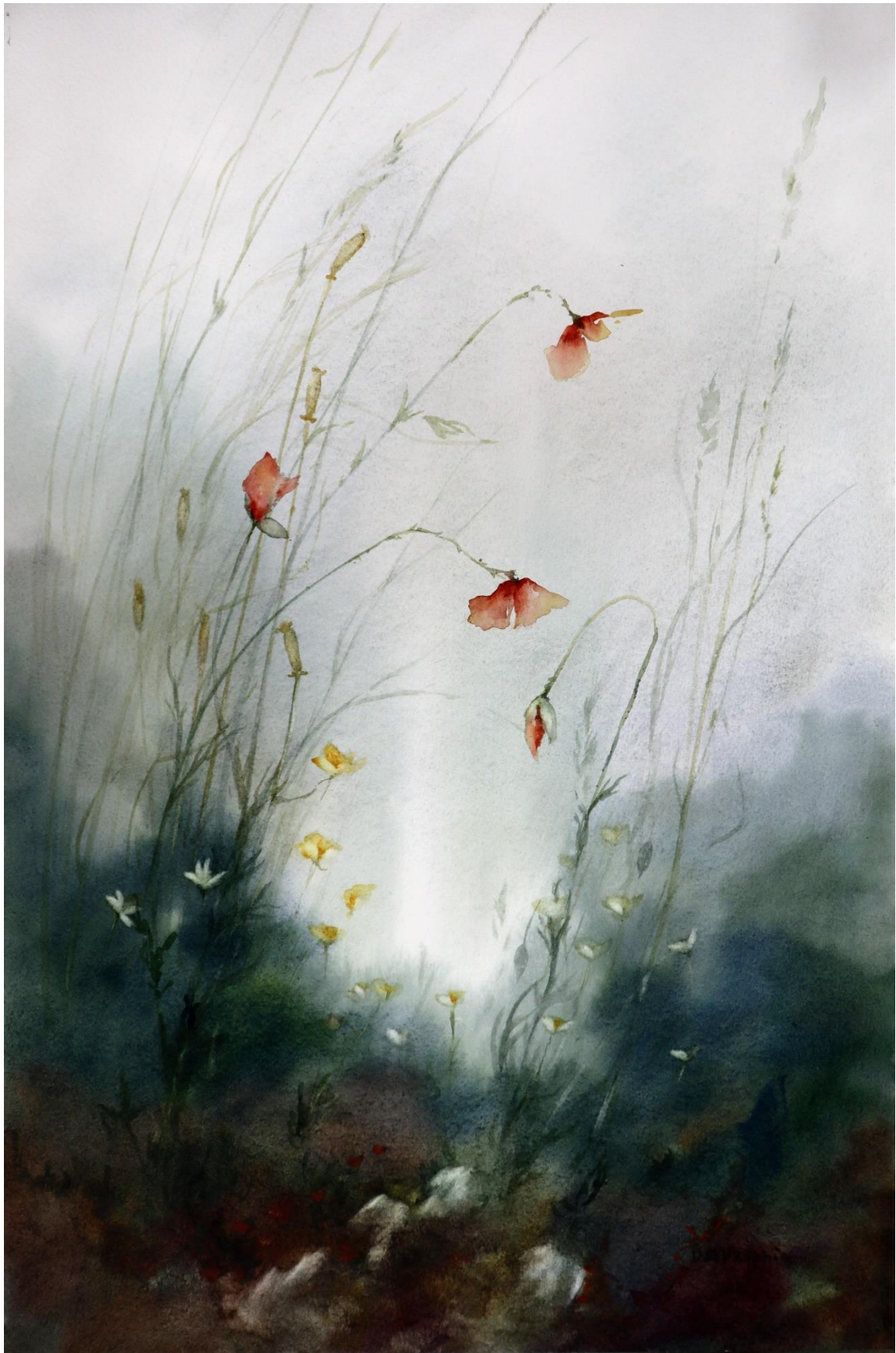
Phyllis Del Vecchio, High Summer , Watercolour, 22x15in