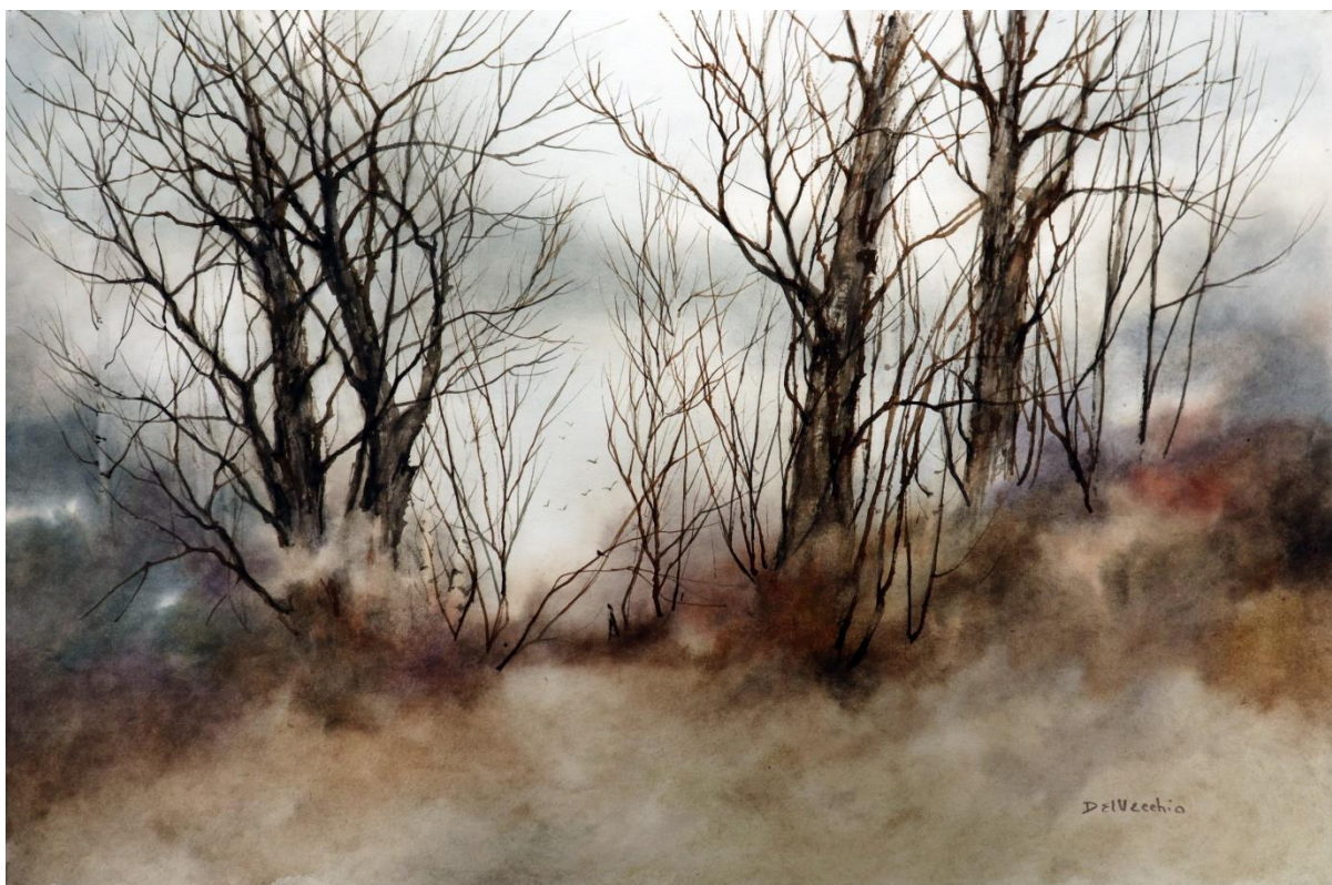
Phyllis Del Vecchio, Dusk , Watercolour, 15x22in