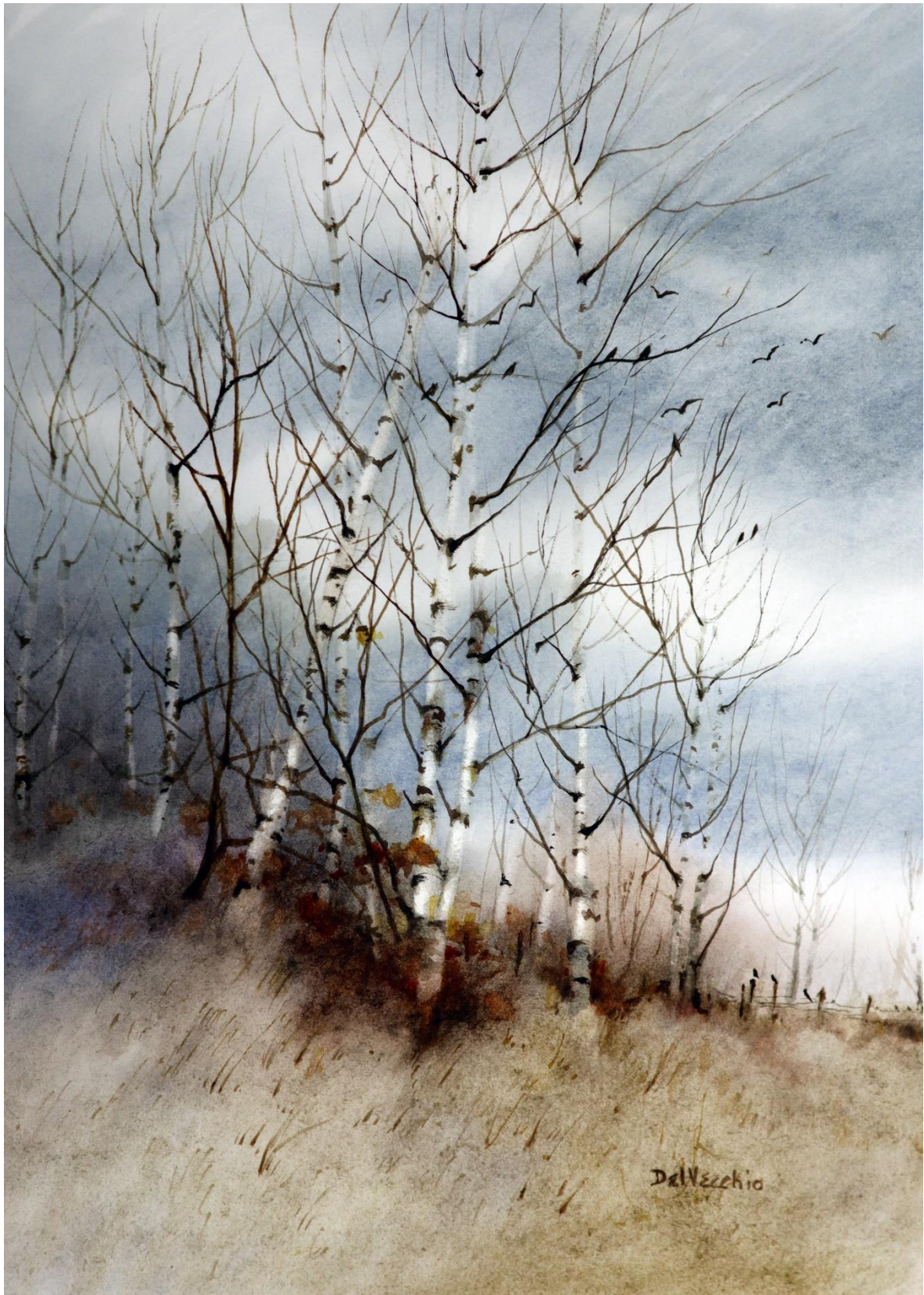
(cover image in full) Phyllis Del Vecchio, Bog Birch , Watercolour, 15x11in