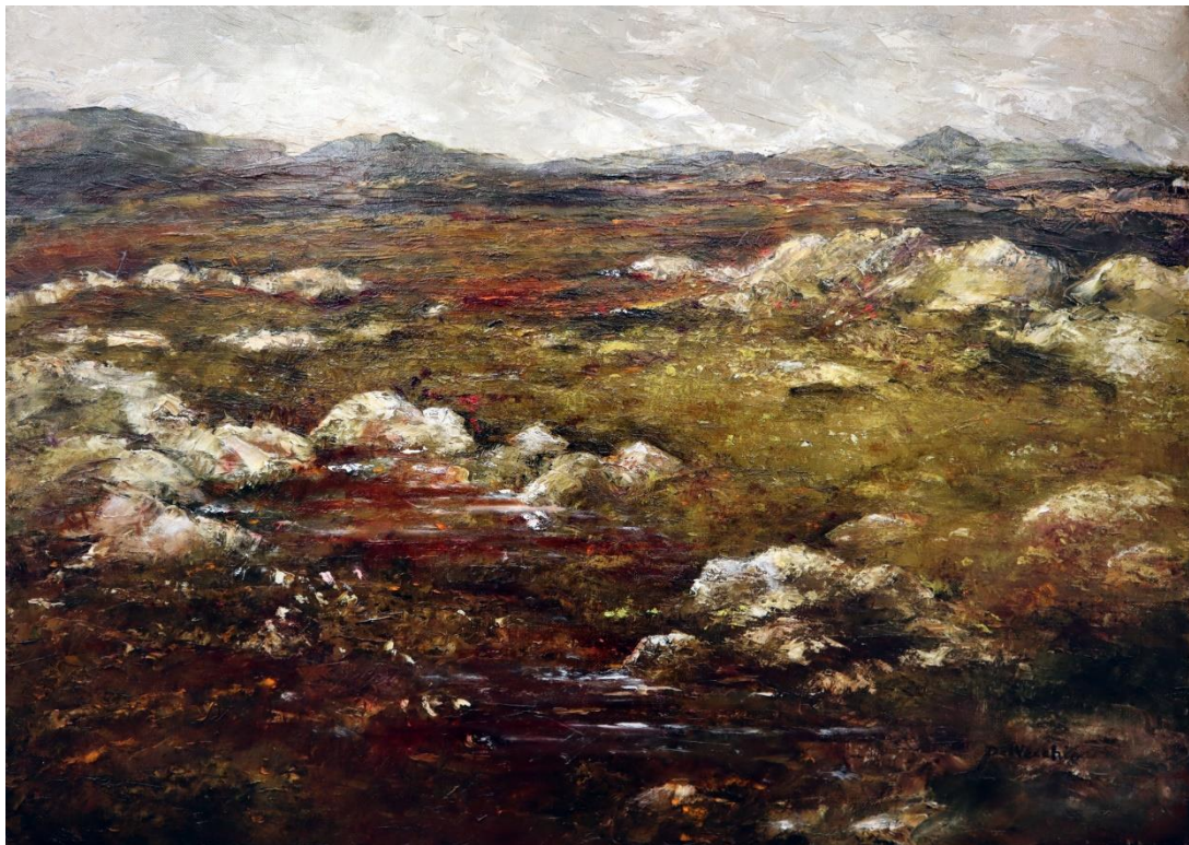
Phyllis Del Vecchio, Quiet Landscape , Oil on Canvas, 22x30in