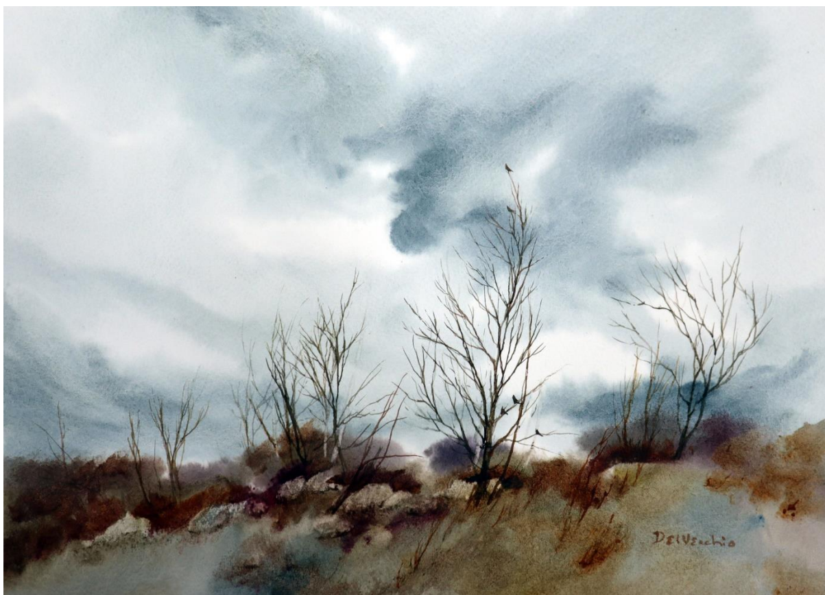
Phyllis Del Vecchio, Highest Perch , Watercolour, 11x15in