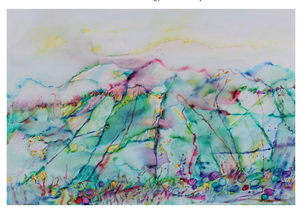
Martina Furlong, (40) Awaken The Eternal, Ink pens on paper, 12x15.5in