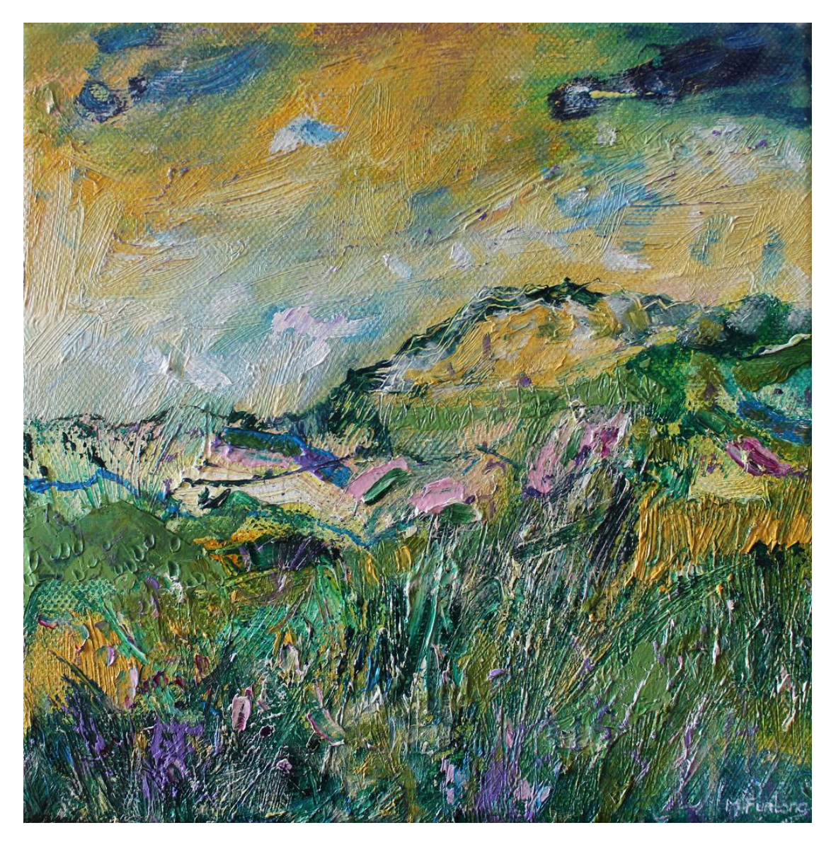
Martina Furlong, (1) A New Day (2022), Oil on Canvas, 8x8in