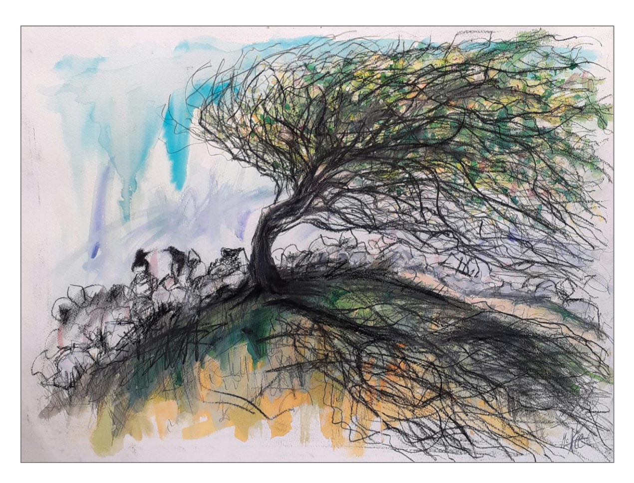
No.8 Two for Joy, watercolour on paper, 22x30in