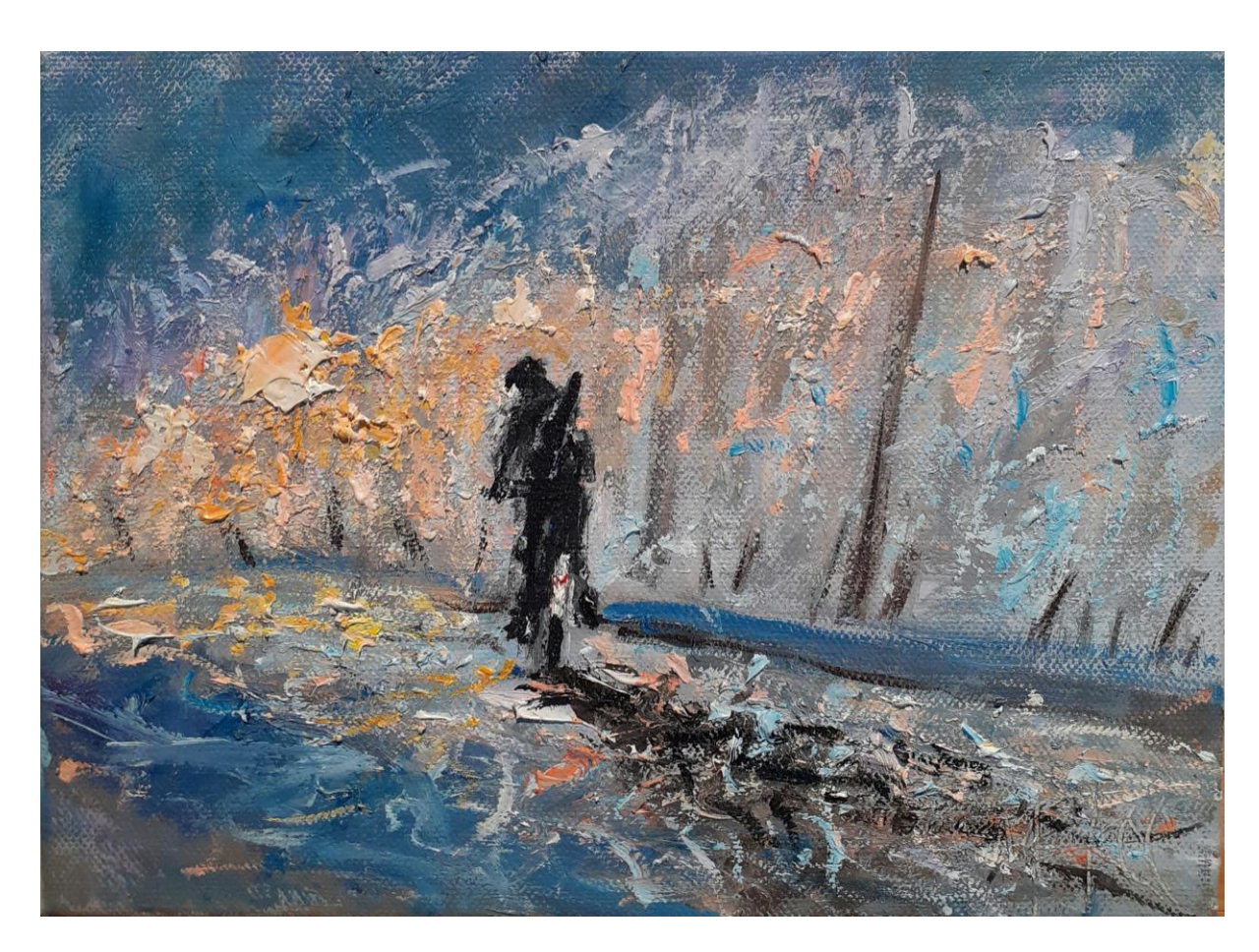
No.9 Morning Light, oil on canvas, 7x8in