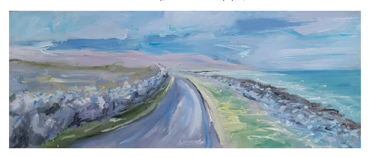
No.26 Flaggy Shore, oil on panel, 8x20in