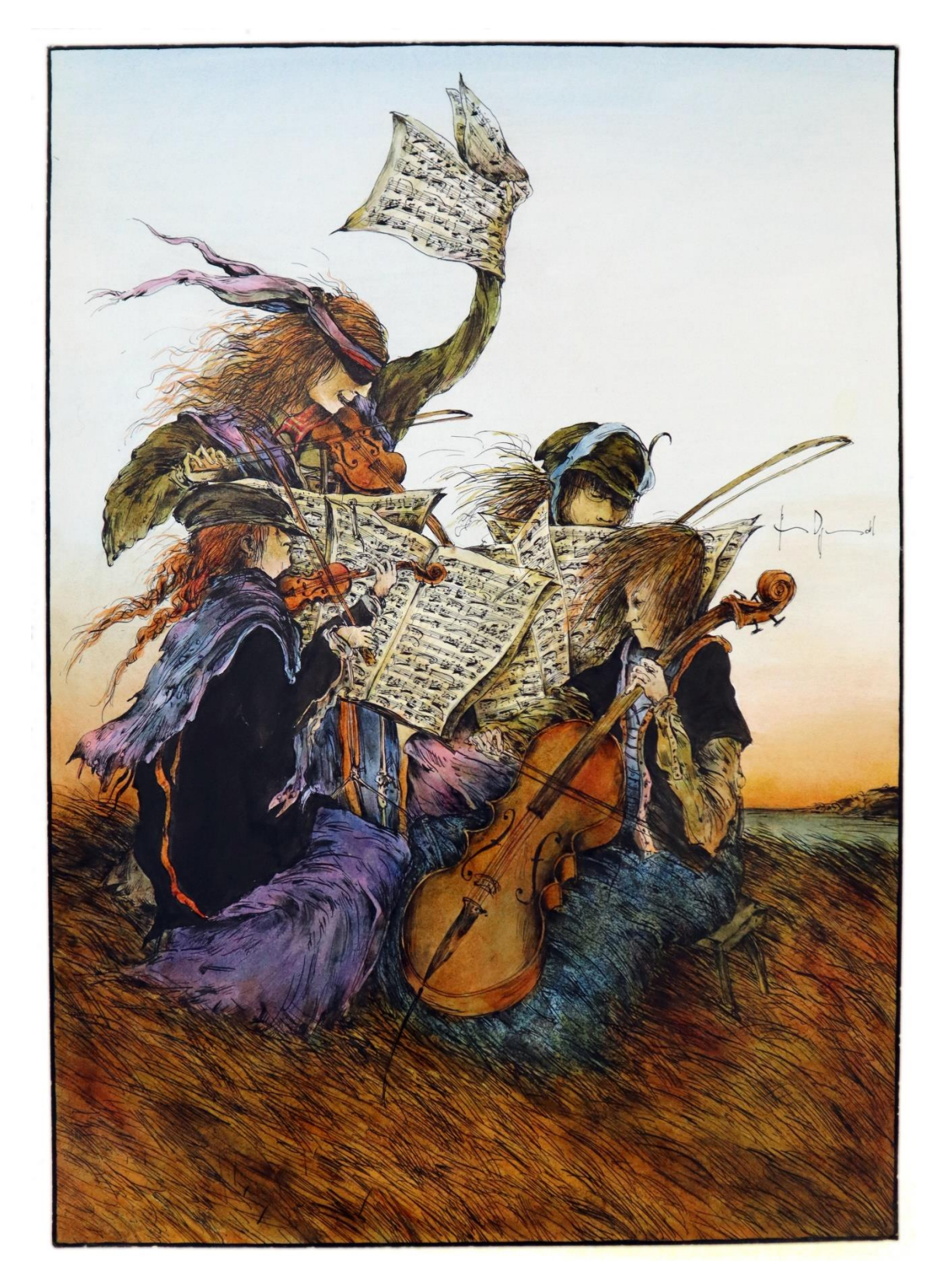
No.7 Spätherbst (Late Autumn) / Women in Music, Gouache and Ink on Paper, 20x14in