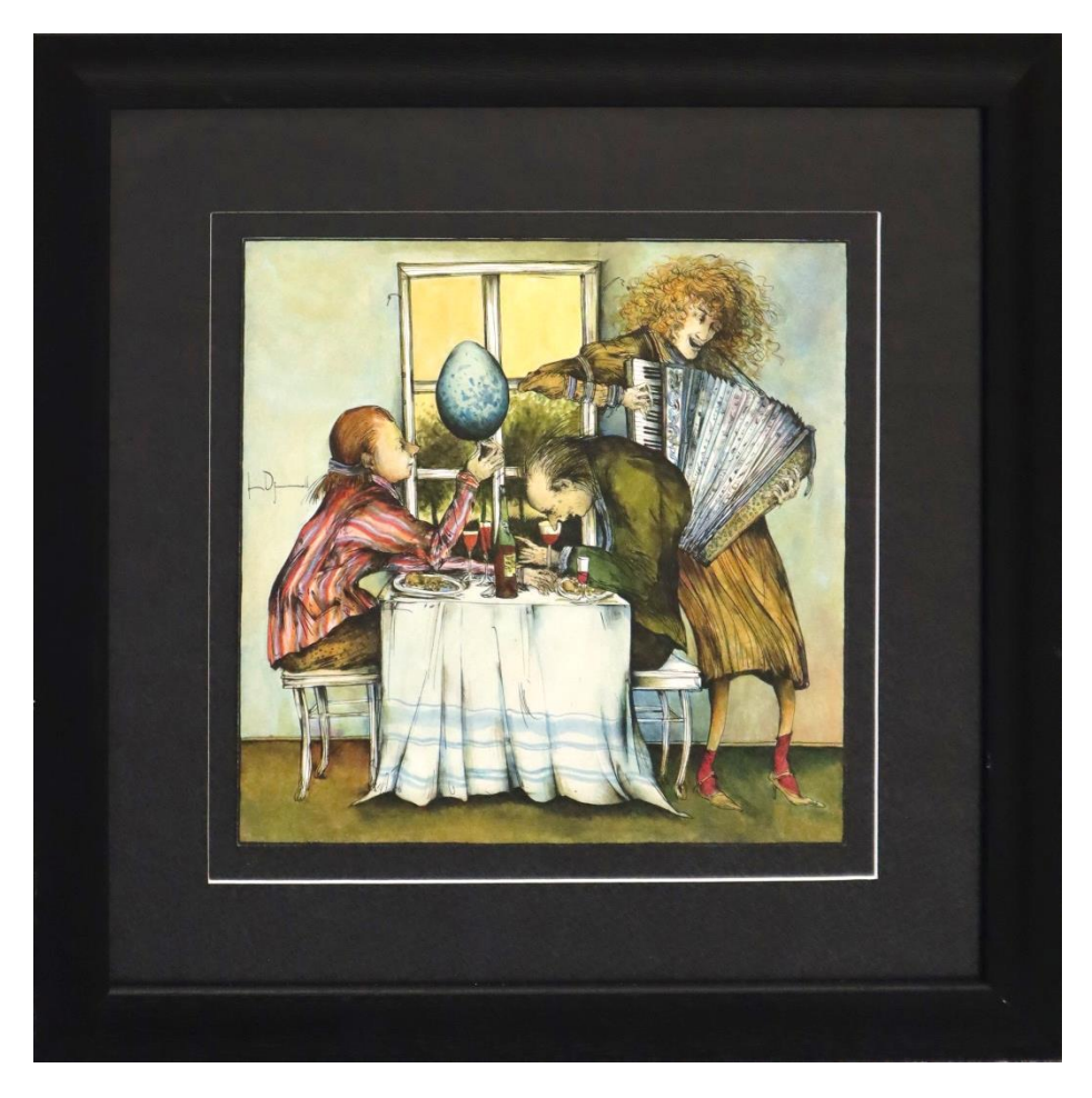
No.1 The Blue Egg Gouache and Ink on Paper, 35.5x35.5cm , 14x14in