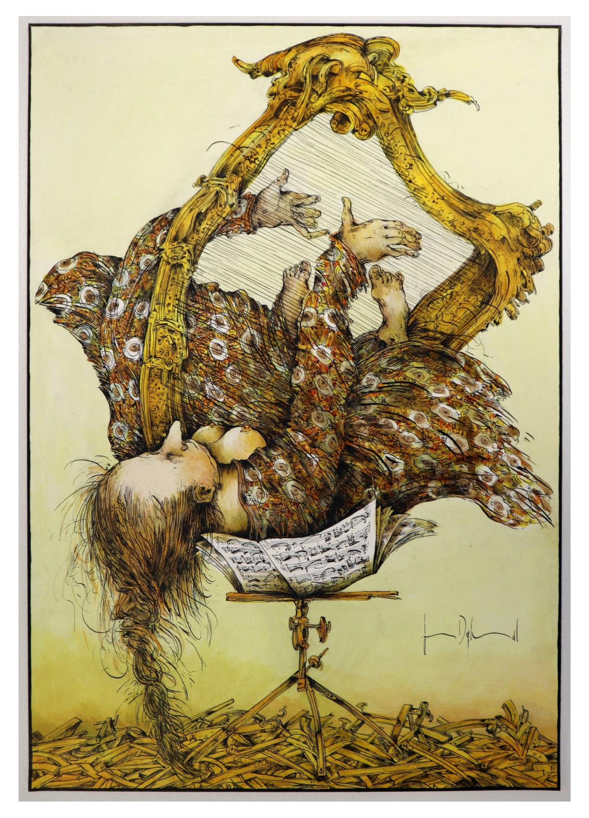
No. 6 Occupational Hazard Gouache and Ink on Paper, 51x35.5cm , 20x14in