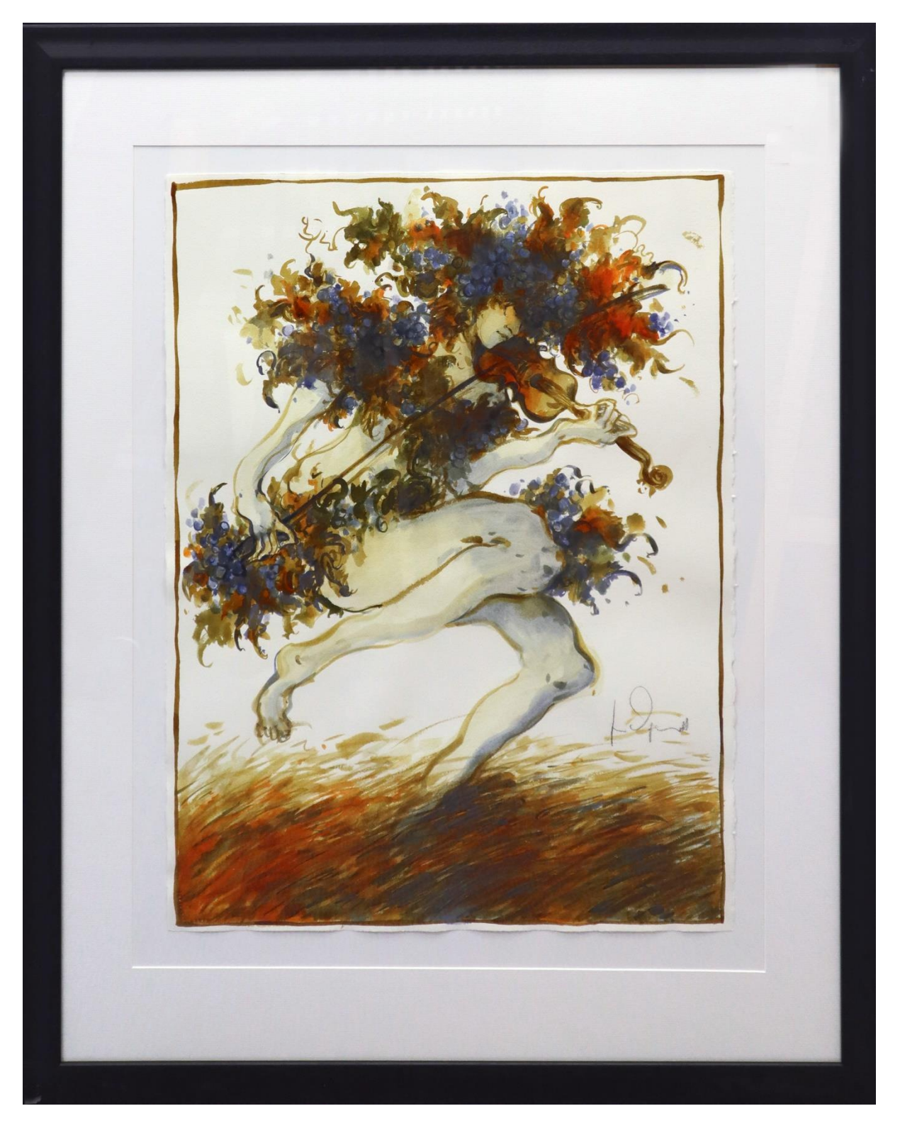
No.11 Reverie Brush Drawing (Ink on Paper), 76x56cm , 30x22in