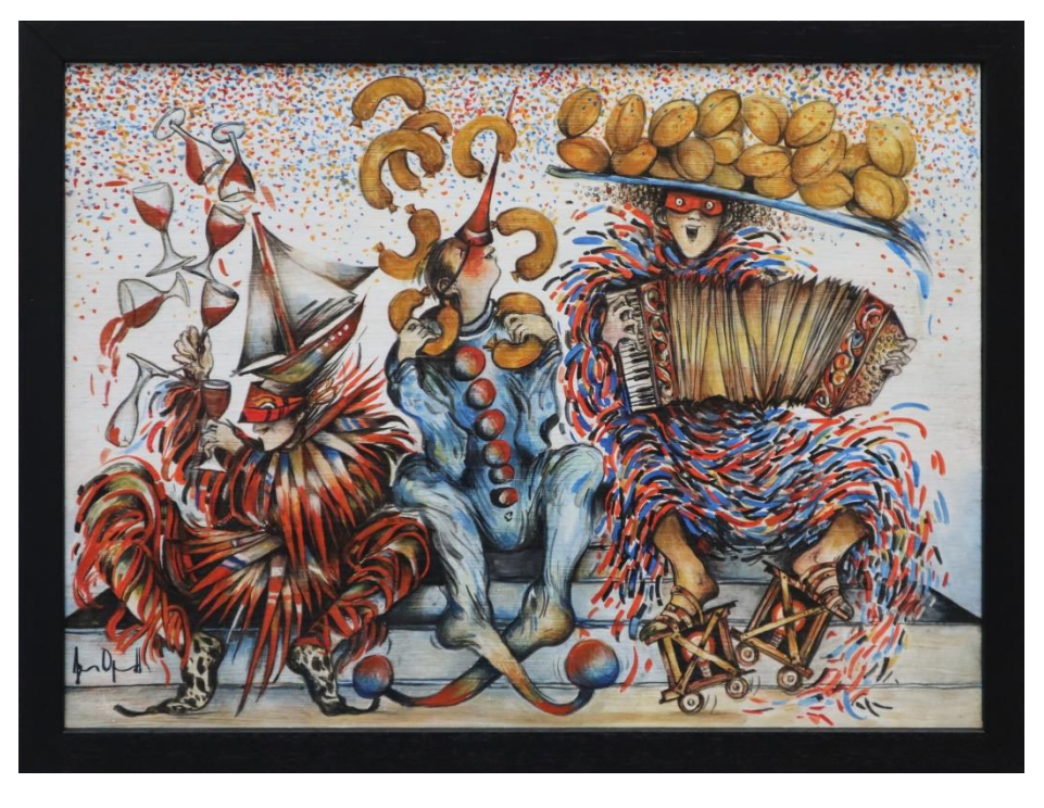
No.2 Eat, Drink and be Merry , Tempera on Board, 12x16in