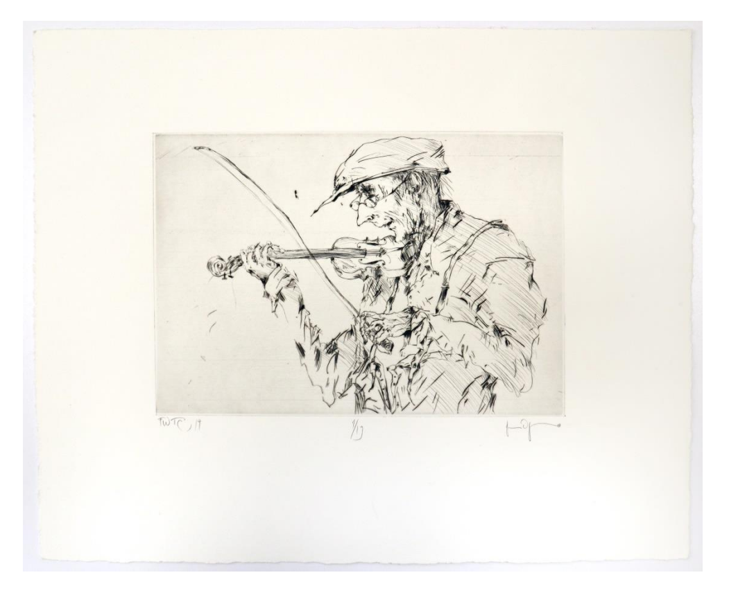
No.38 Farewell to Connacht 14, Etching, 1/19, 12.5x16in

View the full exhibition: <a href="https://www.bit.ly/40pGWP7">https://www.bit.ly/40pGWP7</a>