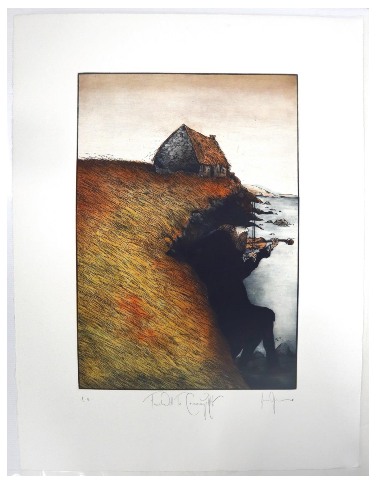
No.43 Farewell to Connacht, Aquatint Etching, Edition, e.a., 22x16in