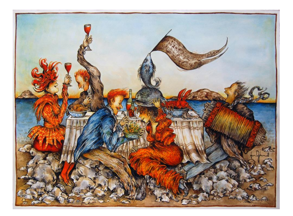
No. 24 Galway Bay Brush Drawing (Ink on Paper), 56x76cm, 22x30in

View the full exhibition: <a href="https://www.bit.ly/40pGWP7">https://www.bit.ly/40pGWP7</a>