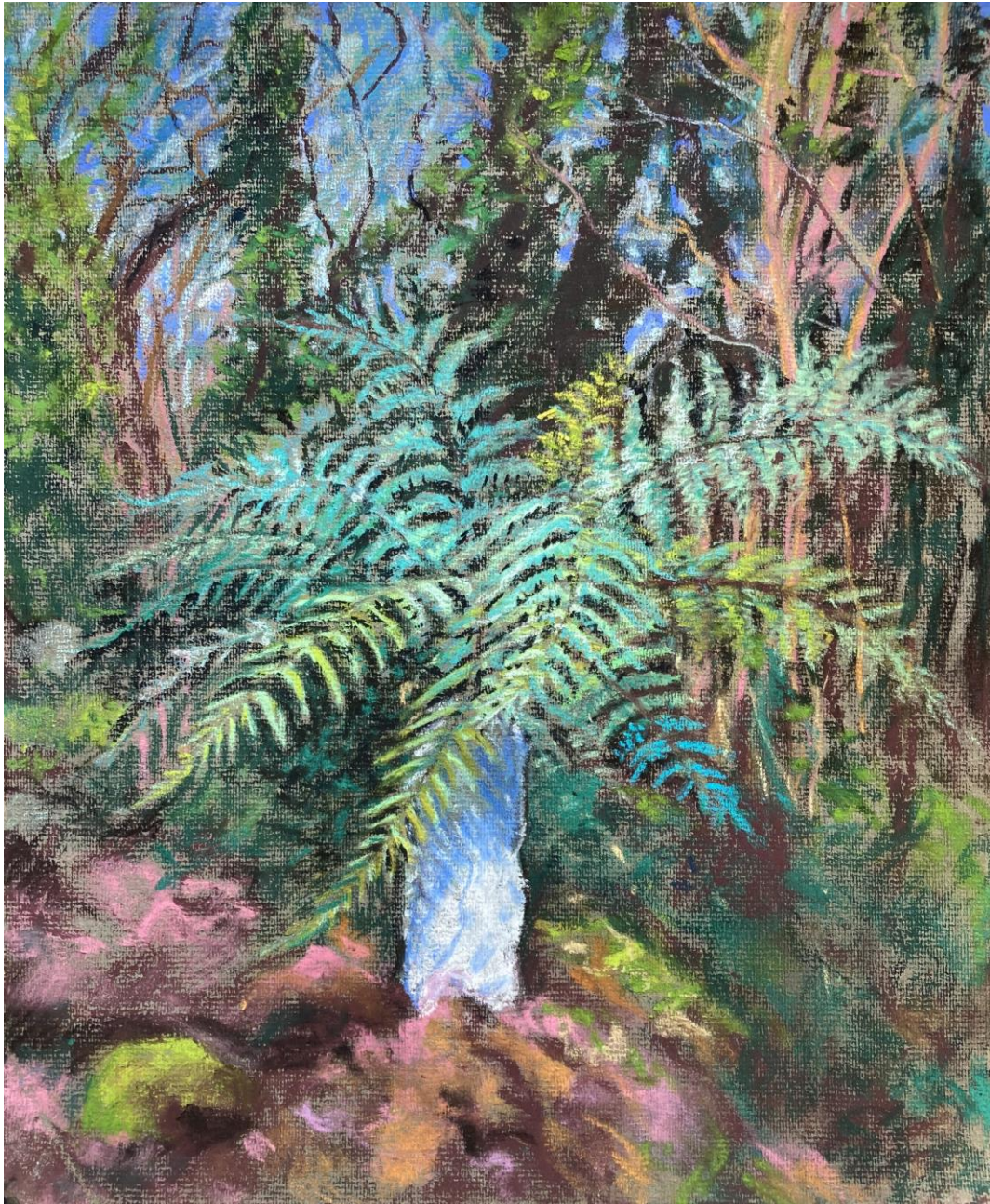
New Zealand Tree Fern, protected for Winter, Pastel, 16x12in