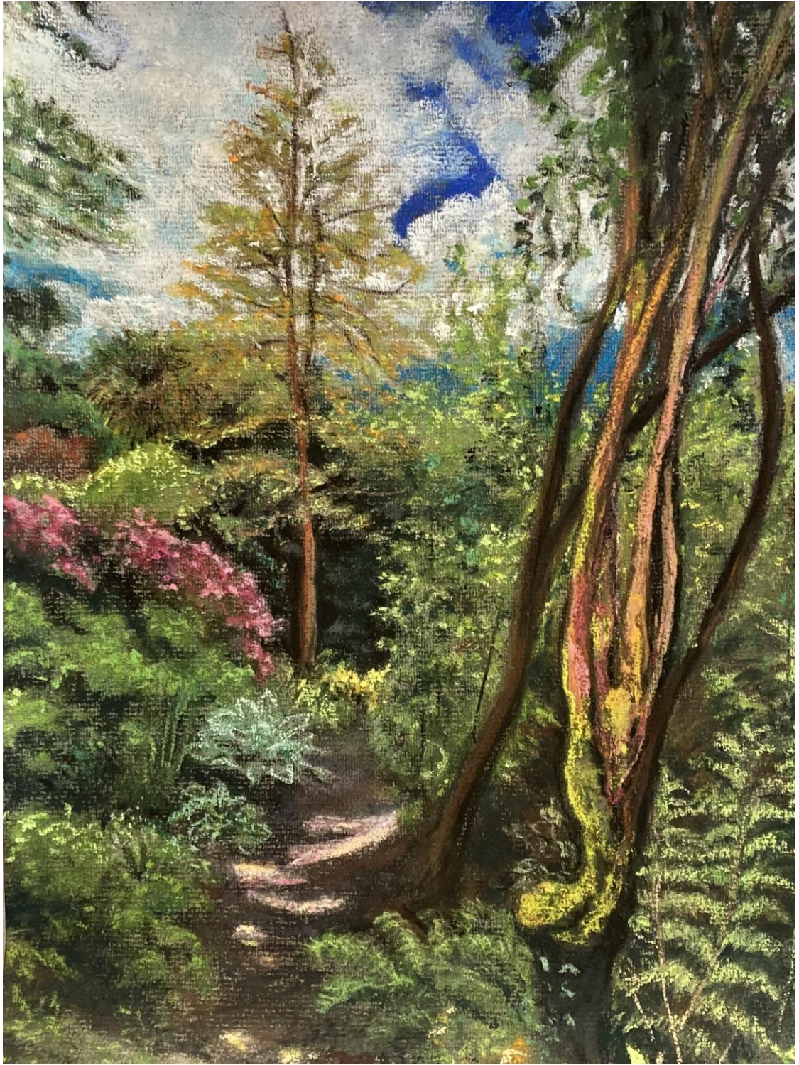
The Heron Garden , Pastel, 16x12in