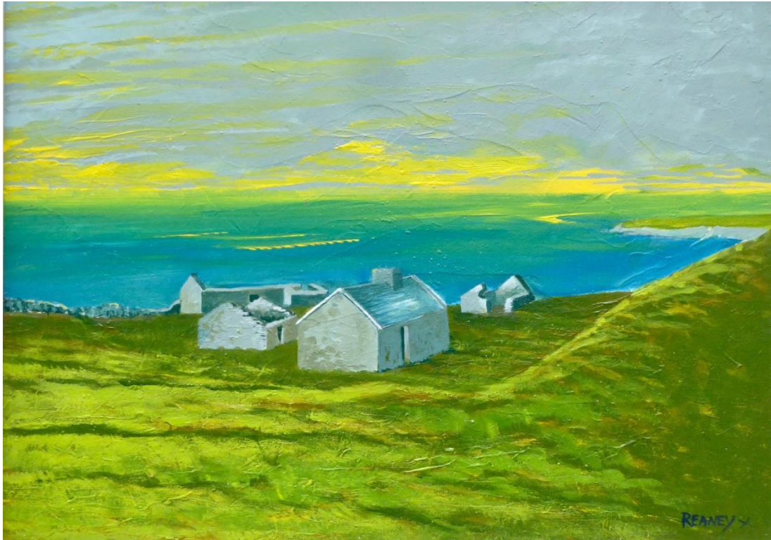
Pádraic Reaney No.4 Evening on Inishark, Acrylic on Board, 12x16in