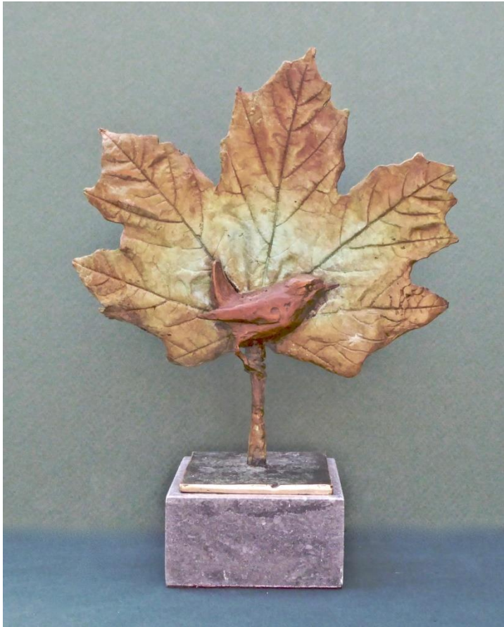
< Pádraic Reaney, Wren, Bronze, unique, 11x10x3in