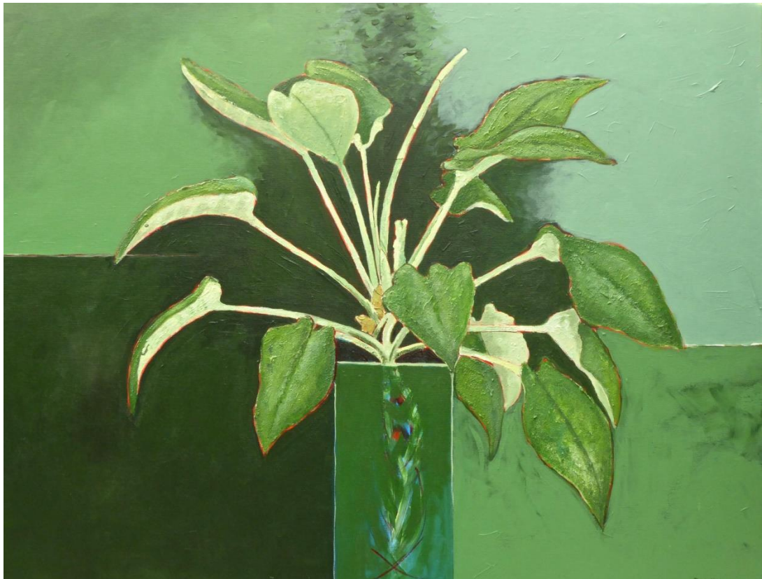
Pádraic Reaney No.8 Plant I, Acrylic on Board, 28x35in