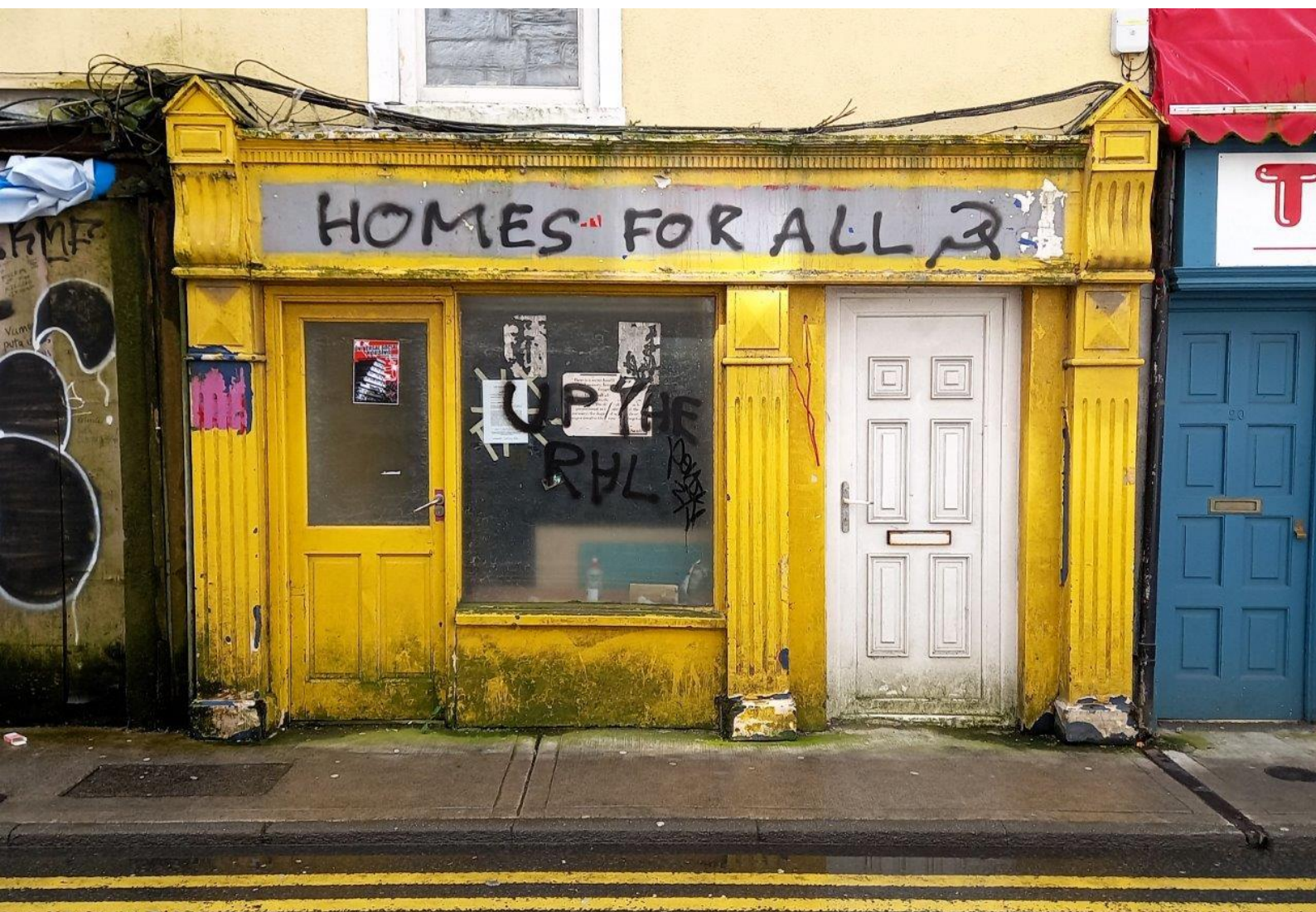
Illustration: Dean Kelly, Homes for All (2024), digital media, ed.9, 22x33in