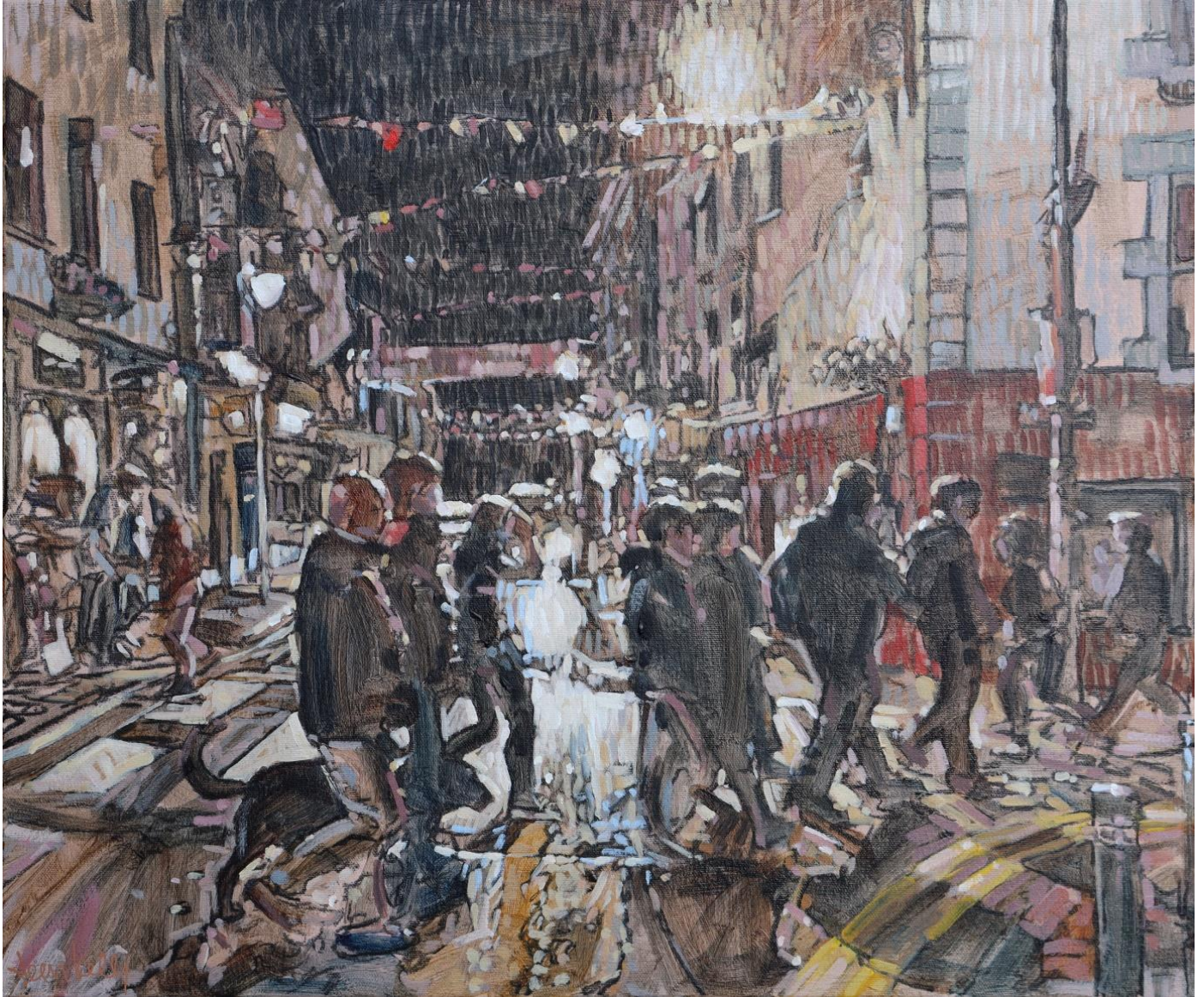
Dean Kelly, Photonic / Cross Street, Galway (2025), acrylic on canvas, 20x24in

These are just a small sample of the more than 40 exhibits!