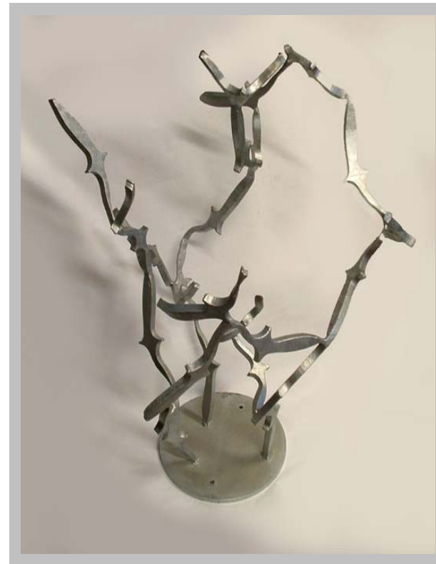
41.* Birds I, 35x30x26"