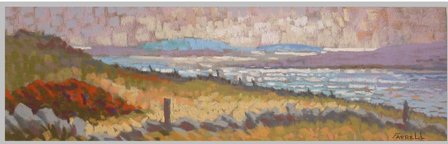
10. Looking towards Dog's Bav from Inishnee. Pastel. 4" x 10½"