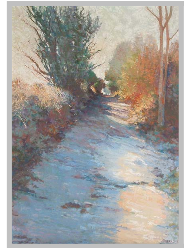
27. The Boreen, Cappagh, 27x18½"