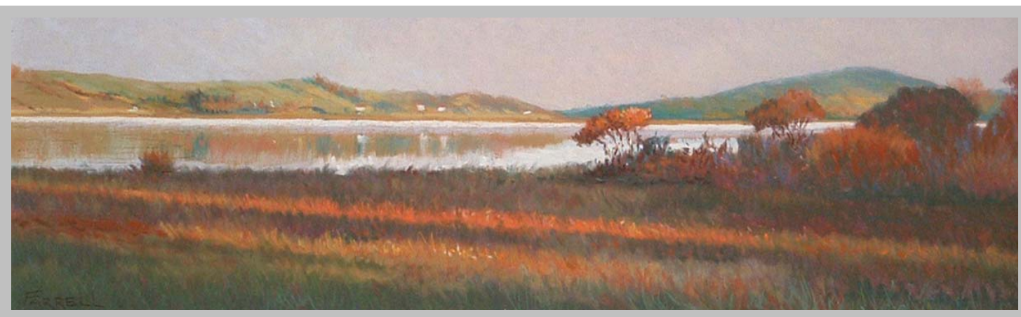
16. Evening Light, Loughrea, Pastel, 6" x 18"