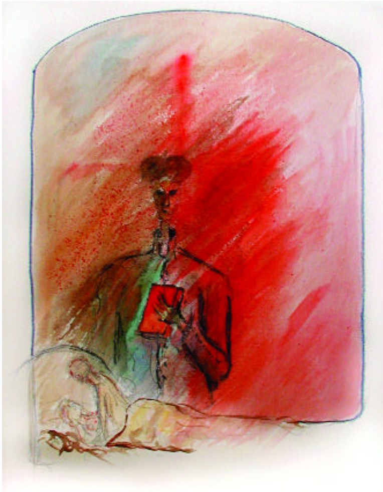
"Cried that we lived like beast and beast" Watercolour & Charcoal 36 x 26 cm