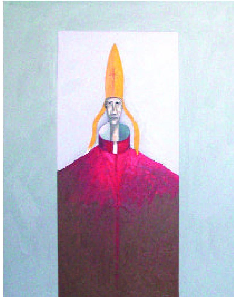
The Bishop oil on canvas 115 x 92 cm