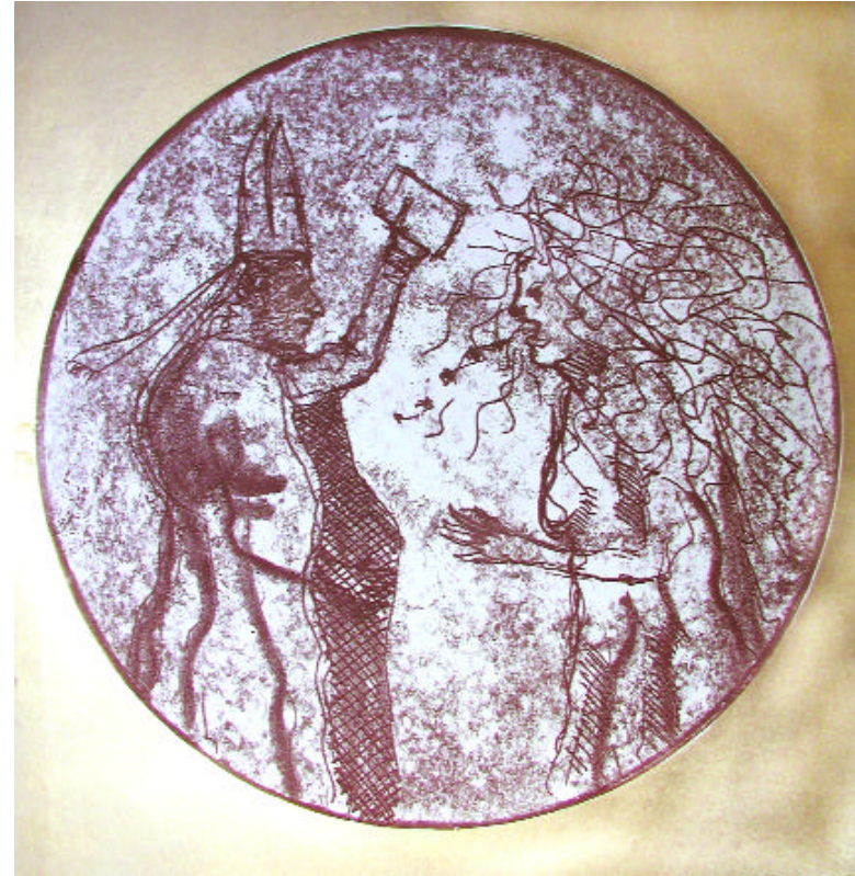
"But should that other one come, I spit:" mixed media 77 x 51 cm