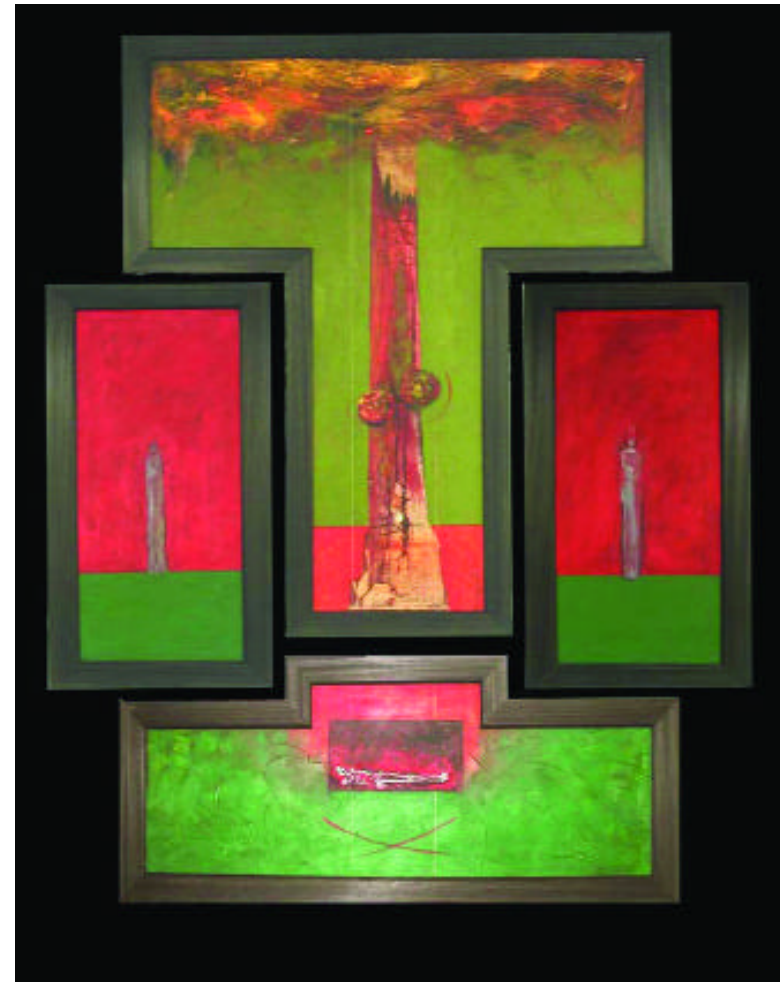
"Did he die or did she die" oil & gesso on board 196 x 123 cm