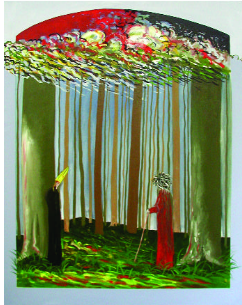
"Fair and foul are near of kin" oil on canvas 115 x 92 cm