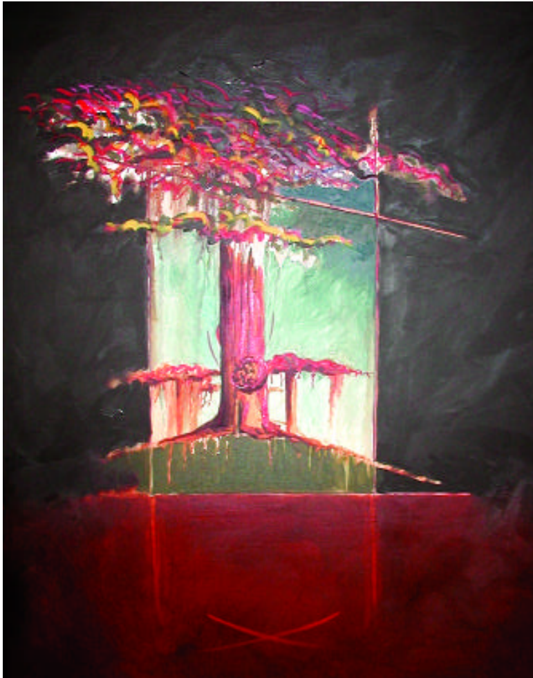
The Blasted Oak oil on canvas 115 x 92 cm