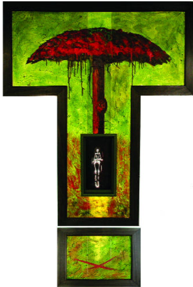
"Nor grave nor bed denied" oil & gesso on board 187 x 119 cm