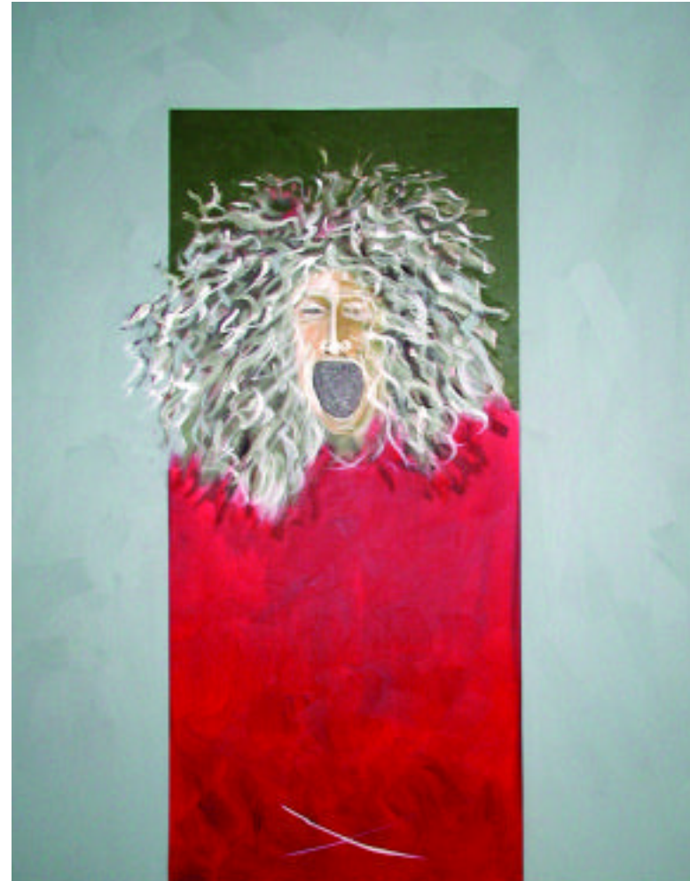
Crazy Jane oil on canvas 115 x 92 cm