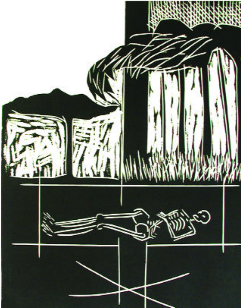
"Nor bed nor grave denied" block print 38 x 31 cm