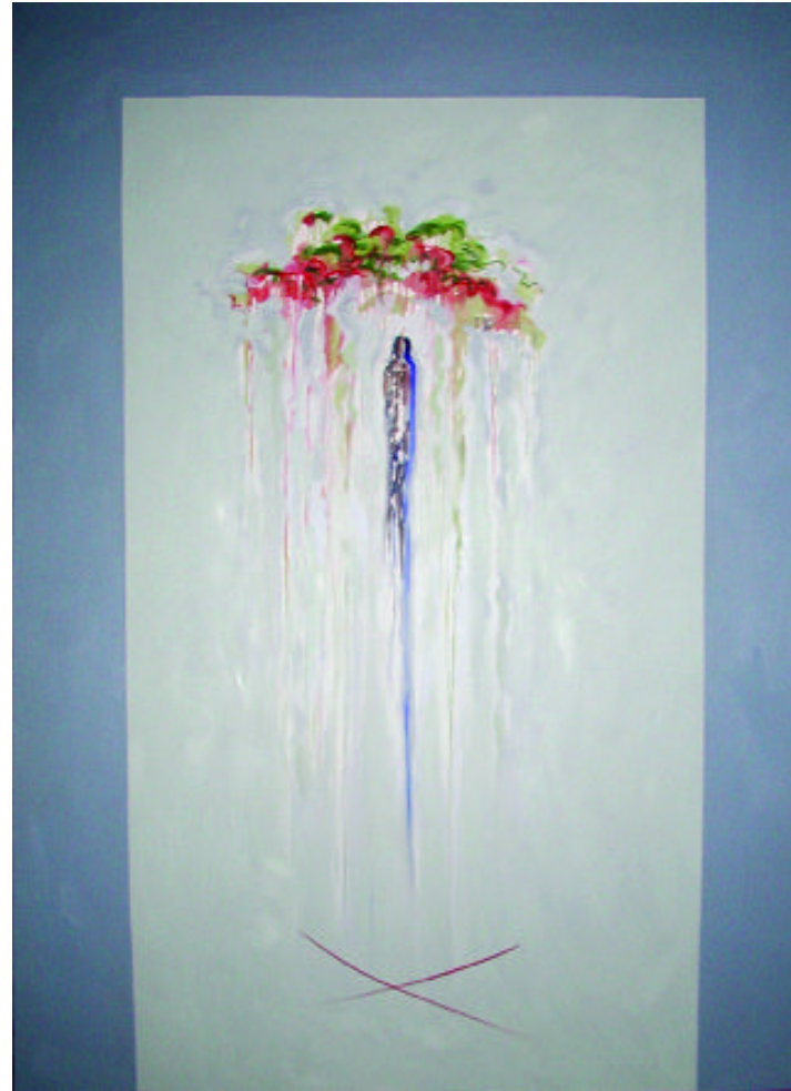
"Jack waiting for Jane" oil on canvas 125 x 92 cm