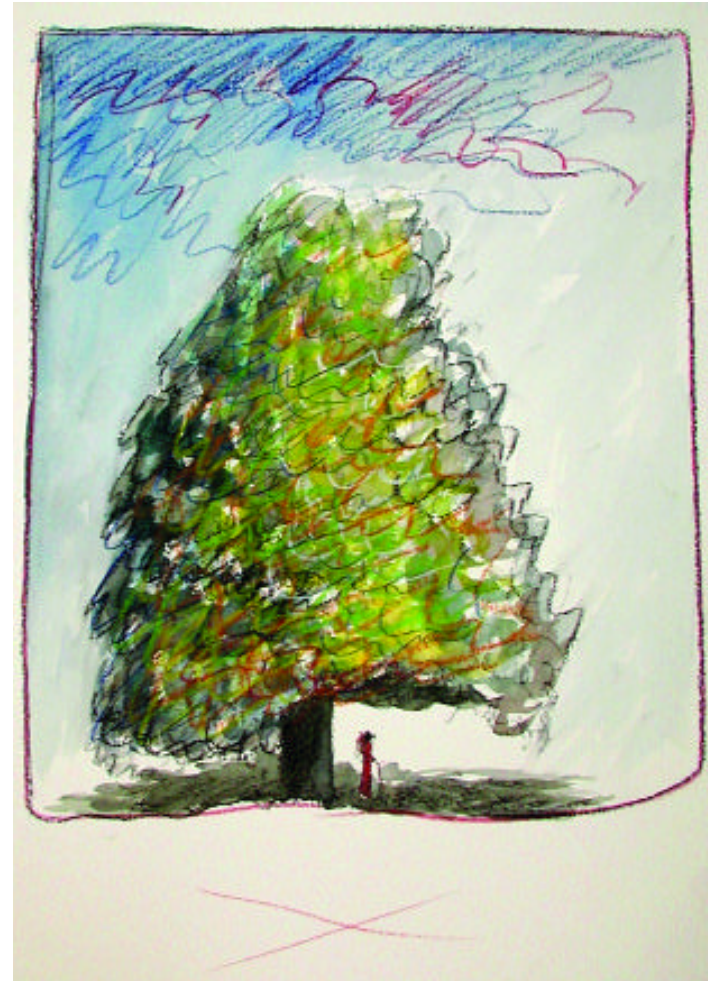
Under the Autograph Tree, Coole Watercolour & Charcoal 36 x 26 cm