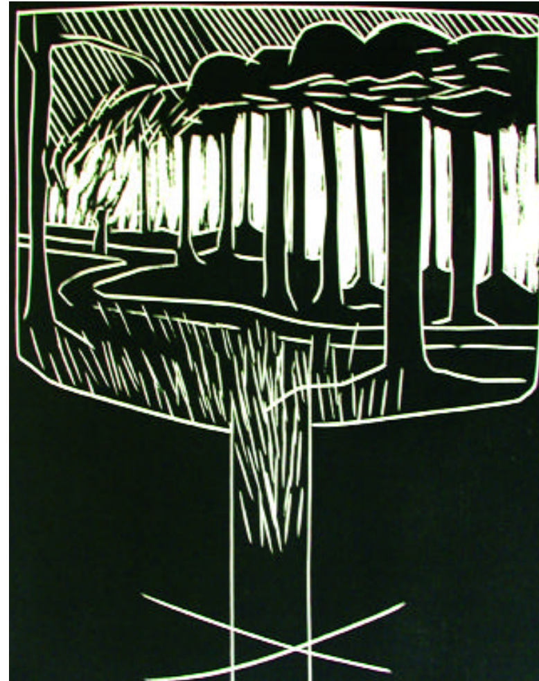
The Bishop walking in the Woods, Coole block print 38 x 31 cm