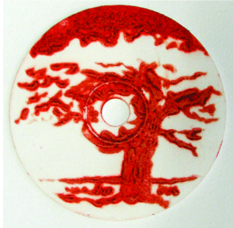
The Blasted Oak drypoint on CD disc 12 x 12 cm