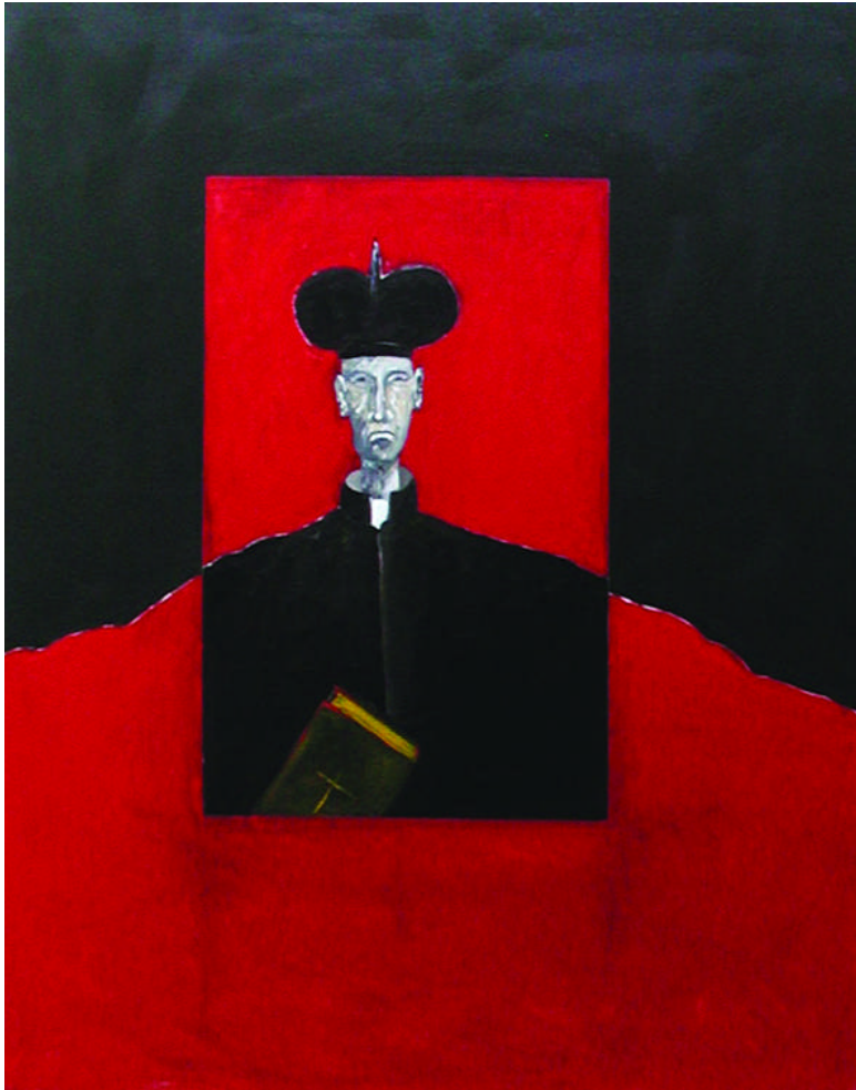
"Nor was he Bishop" oil on canvas 115 x 92 cm