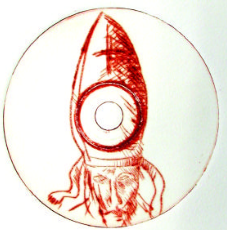
The Bishop drypoint on CD disc 12 x 12 cm