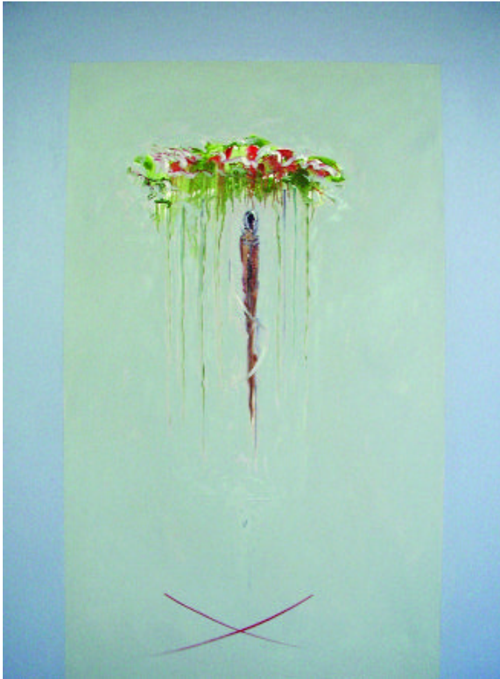
"Jane waiting for Jack" oil on canvas 125 x 92 cm