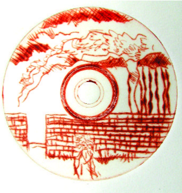
Crazy Jane in the Garden, Coole drypoint on CD disc 12 x 12 cm