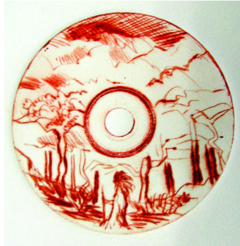
Jane Walking in the Woods, Coole drypoint on CD disc 12 x 12 cm