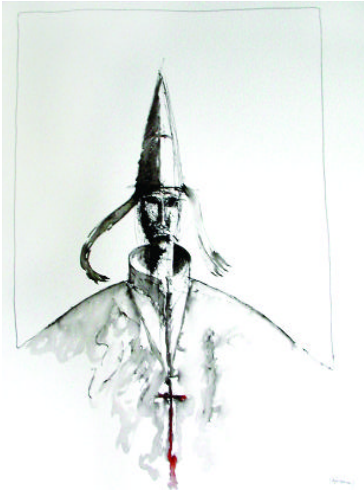
The Bishop Mixed Media 49 x 38 cm