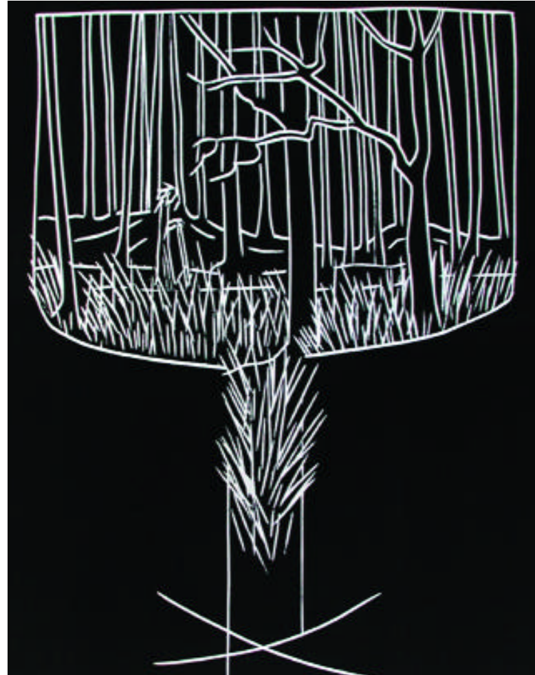
"And much said he and I" block print 38 x 31 cm