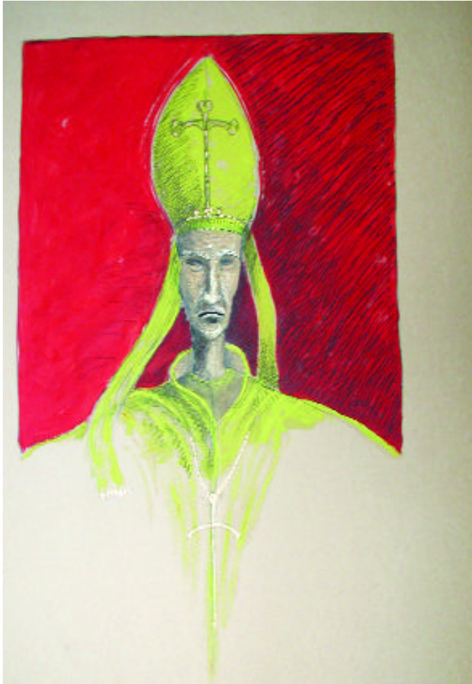
The Bishop mixed media 77 x 51 cm